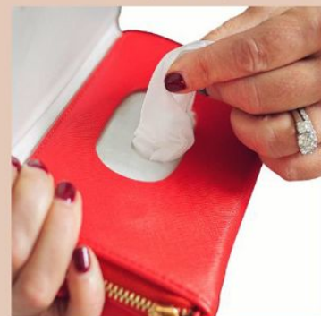
4 yummy colors