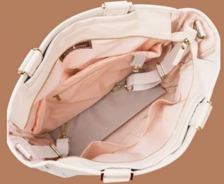
Built-in wiper dispenser