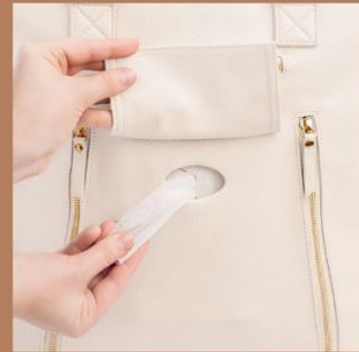
Includes wiper case, large changing mat, crossbody strap and backpack straps