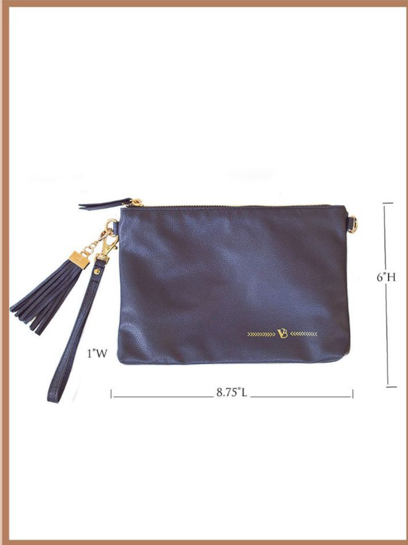
Wear it crossbody style