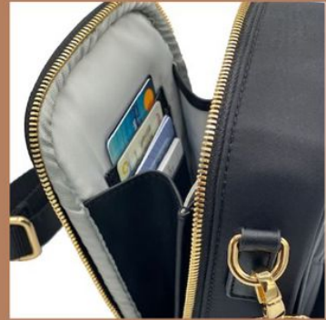
Compact but spacious