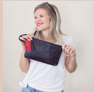
6 fun colors