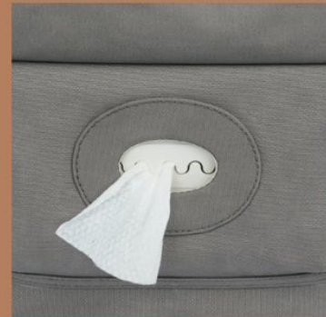
Includes wipes case, large changing mat