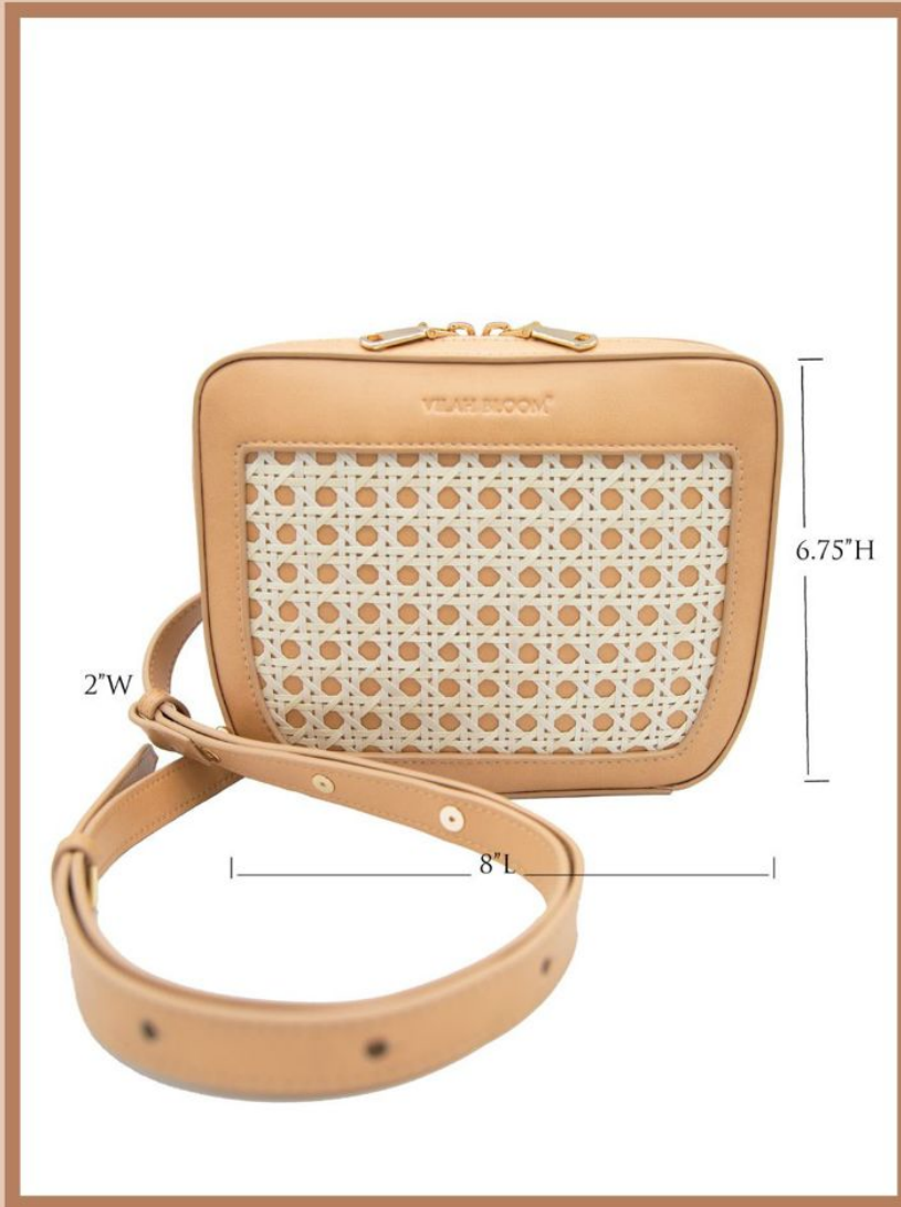
3 CARD SLOTS + KEY CLIP

Spacious interior, 3 credit card slits + key clip