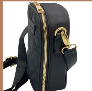
Wide opening & multiple pockets