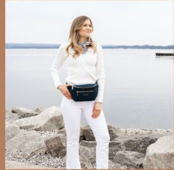
Elastic strap for extra comfort