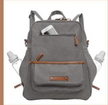
Built-in wipes dispenser