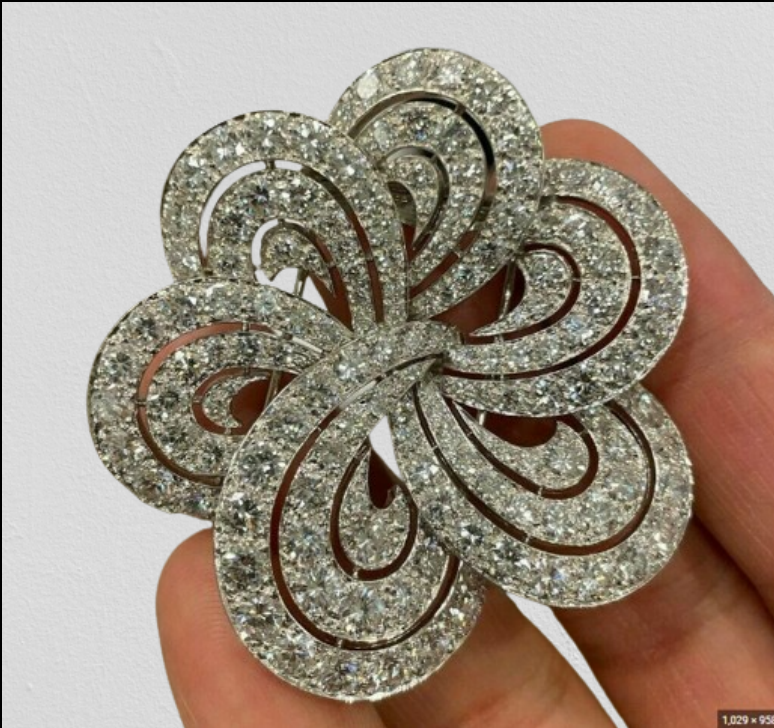
Diamond Floral Brooch

A sparkling brooch in a floral design, featuring intricate loops encrusted with diamonds.