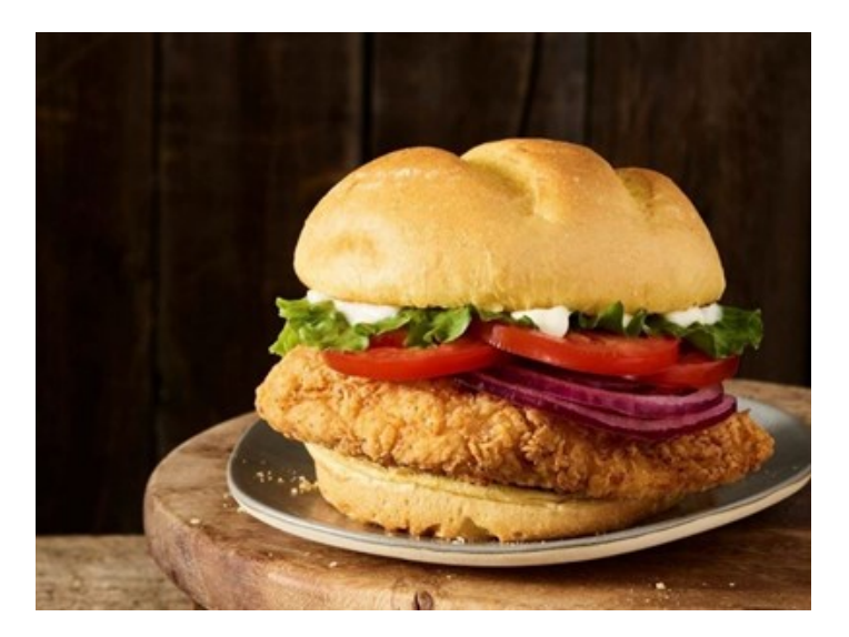
Crispy Chicken Sandwich Supper