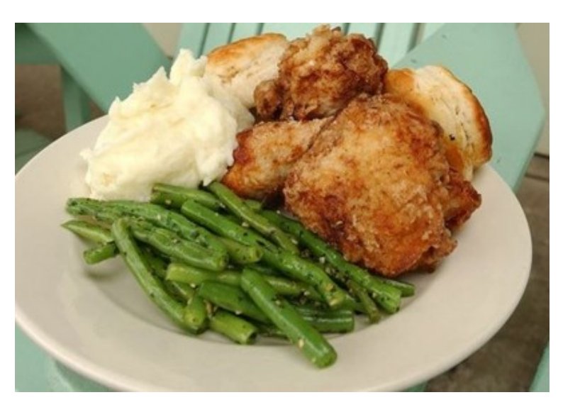
Fried Chicken, Mashed Potatoes and Garlic Buttered Cod, Hush Puppies Biscuits