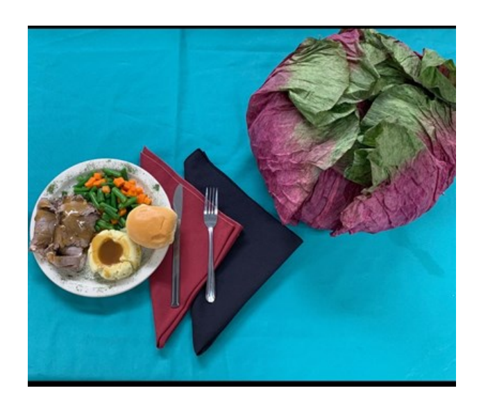
Roast Beef with Gravy, Mashed Potatoes, Mixed vegetables and Dinner Roll