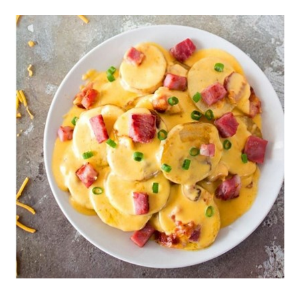
Ham and Potato Au Gratin Lunch