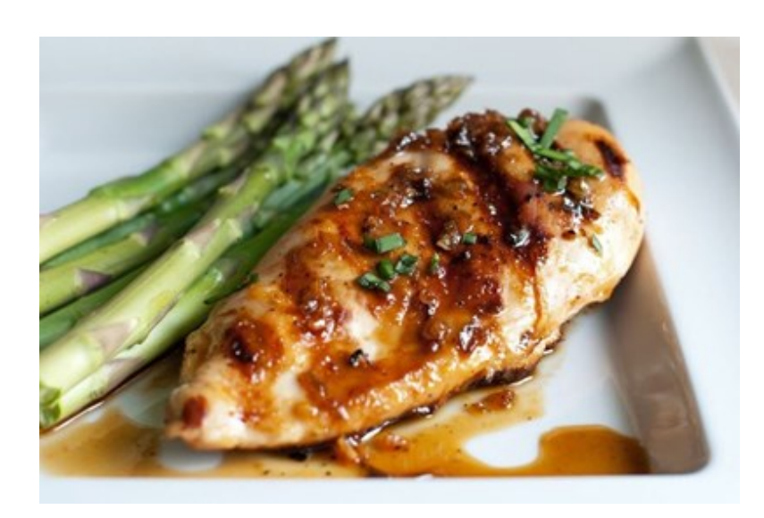
Marinated Chicken Lunch