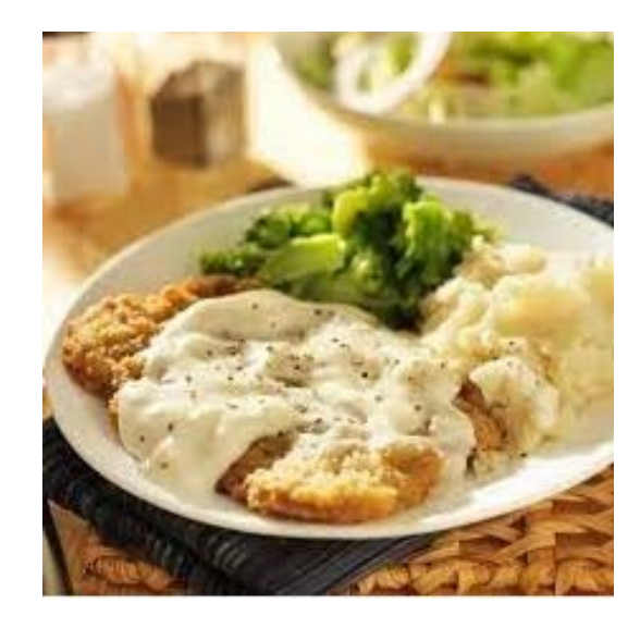
Country Fried Steak, Mashed Potatoes and Broccoli