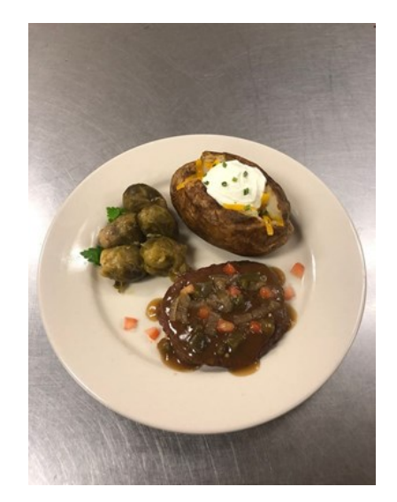
Pepper Beef Patty, Baked Potatoe and Brussel Sprouts