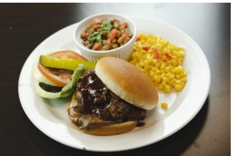
BBQ Pork Sandwich, Corn Salad and Baked Beans