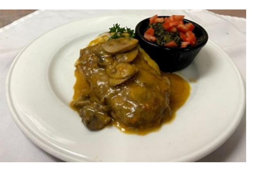
Salisburry Steak, Mashed Potatoes and Spinach