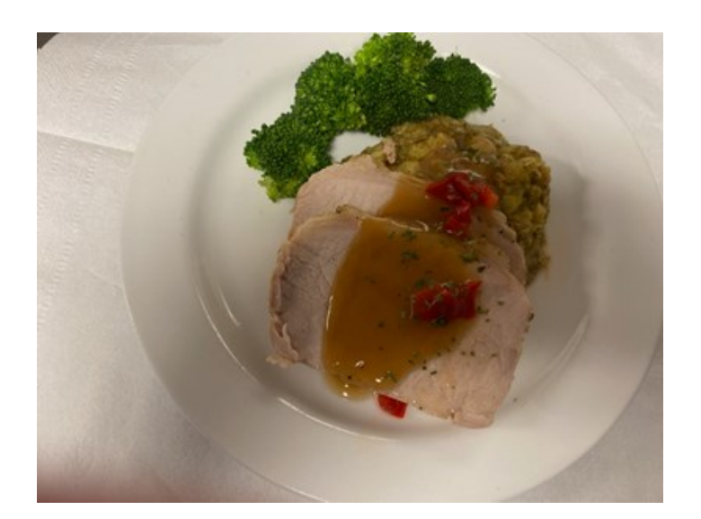
Fresh Roasted Pork, Fresh Steamed Broccoli with Stuffing