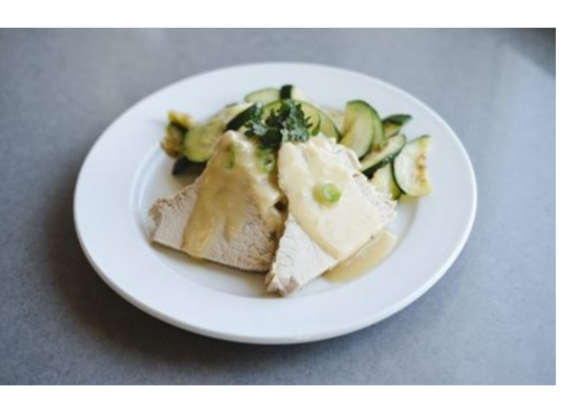
Roasted Turkey and Veggies