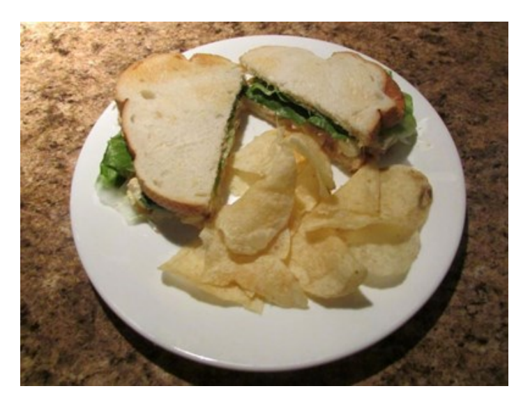
Tuna Sandwich and Chips Supper