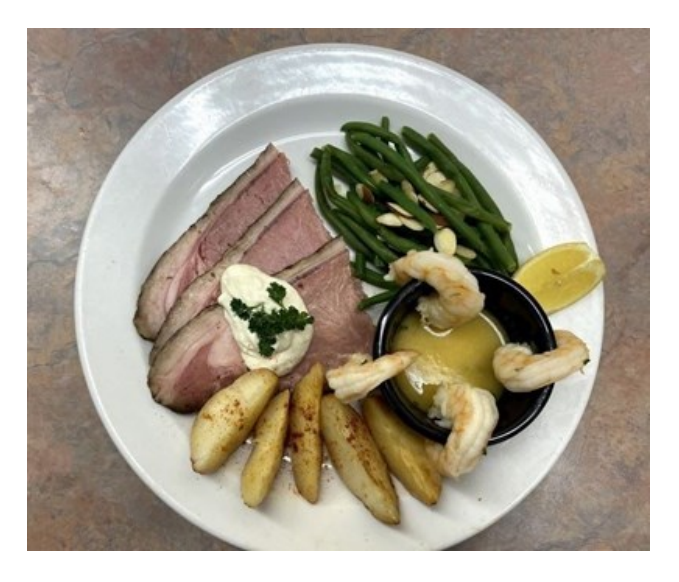
Surf and Turf