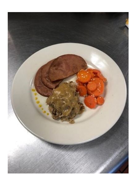
and Bread Stuffing with Gravy