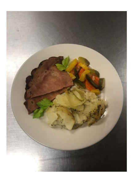
Sliced Ham, Scalloped Potatoes and Mixed Veggies