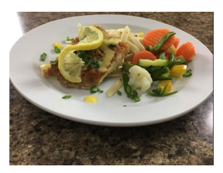
Chicken Piccata and Veggies Supper