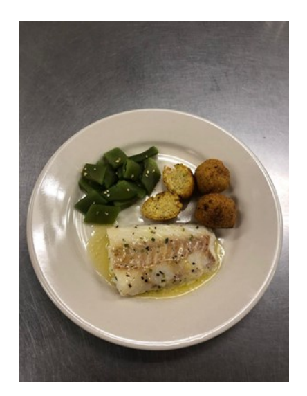
and Italian Green Beans