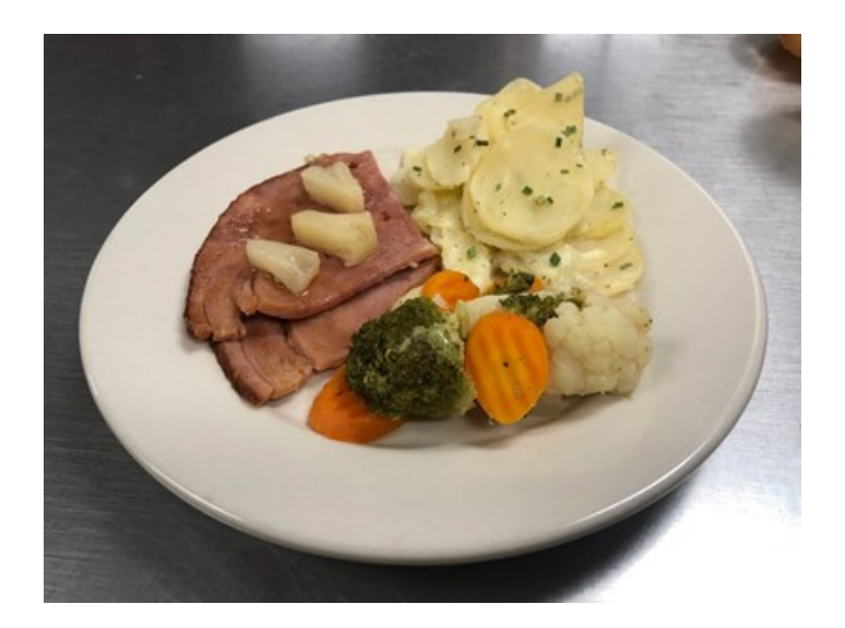
Glazed Ham, Garlic Sesame Carrots Glazed Ham Scalloped Potatoes and Mixed Veggies