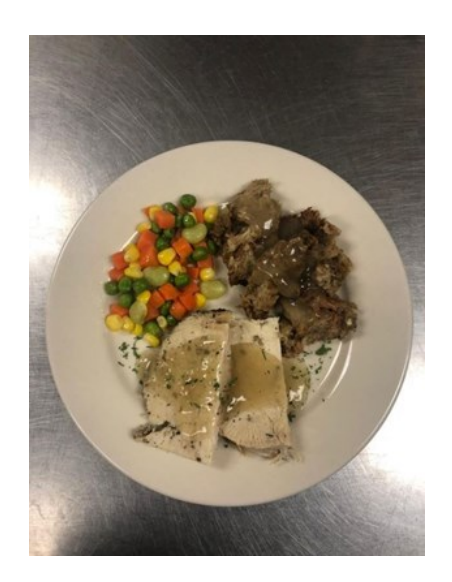
Roasted Turkey, Stuffing and Veggies