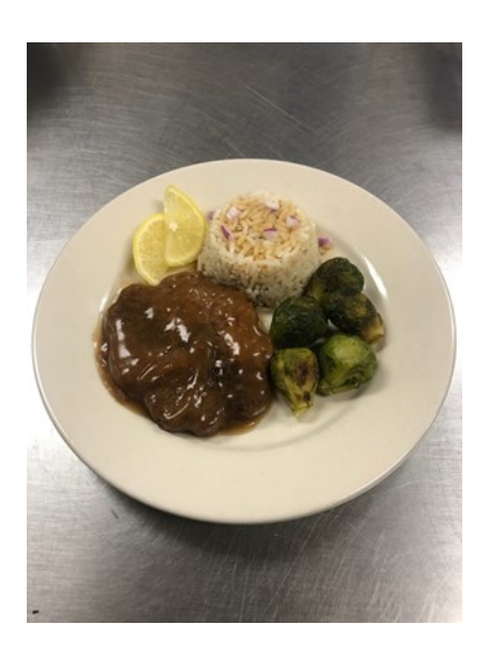
Salisbury Steak, Rice with Soy Sauce and Brussels Sprouts