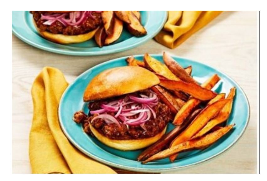
Sloppy Joes and Fries Lunch