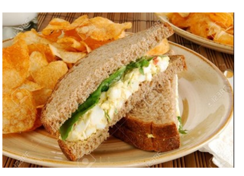
Egg Salad Sandwich and Chips