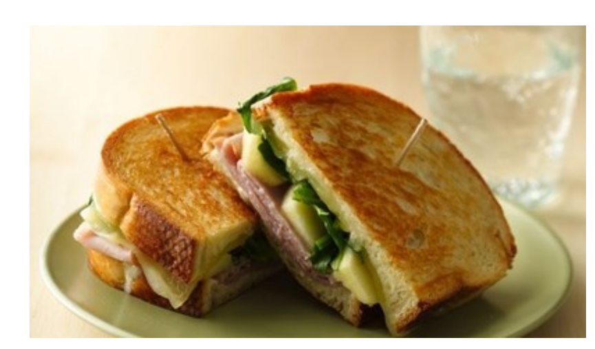
Grilled Ham and Cheese Supper