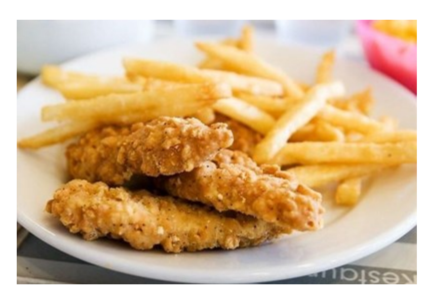
Chicken Tenders and Fries Supper