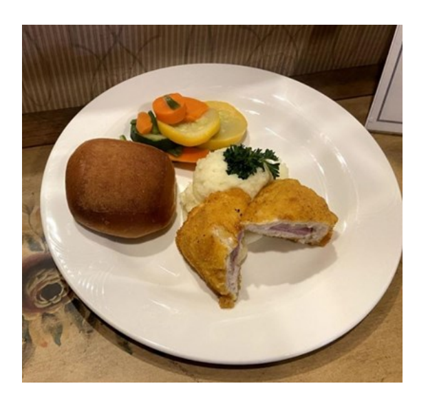
Chicken Cordon Bleu, Mashed Potatoes and Dinner Role