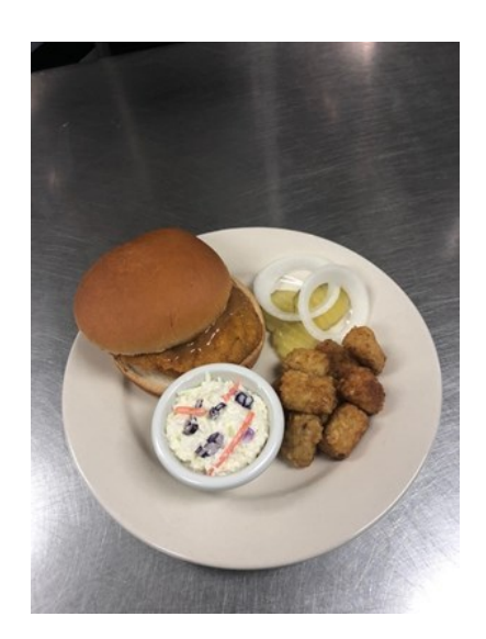
Pork Fritter on Bun, Tatters and Cole Slaw