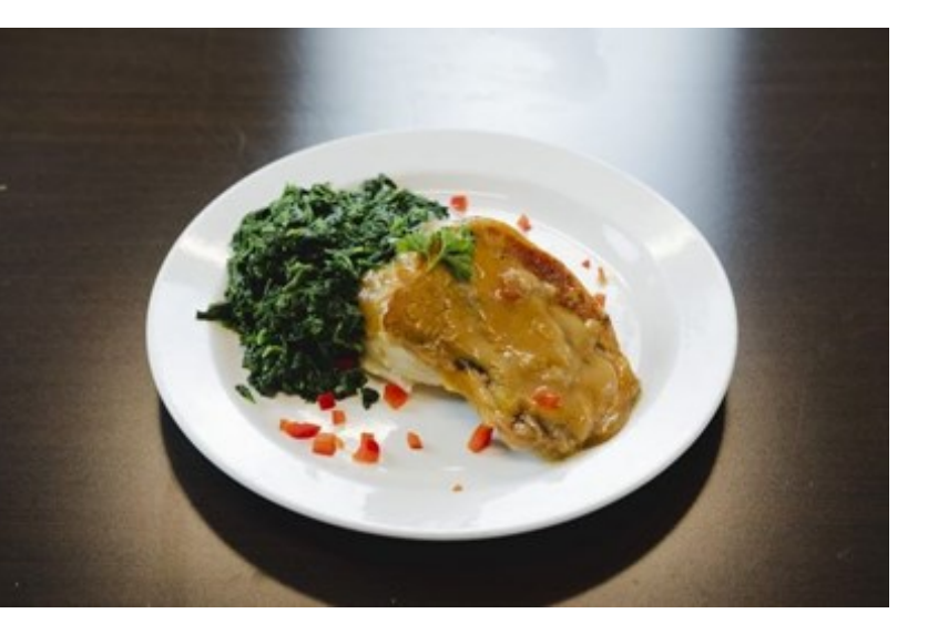
Smothered Pork, Mashed Potatoes and Spinach