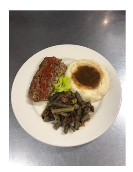
Meatloaf, Mashed Potatoes, Green Beans and Bacon