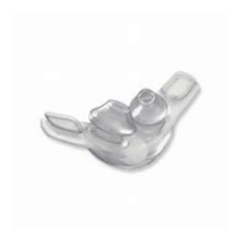
Swift FX Cushions