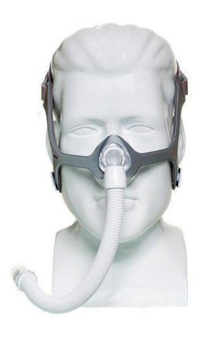
Wisp Complete mask System FitPack