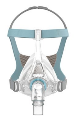
Vitera Complete Mask System