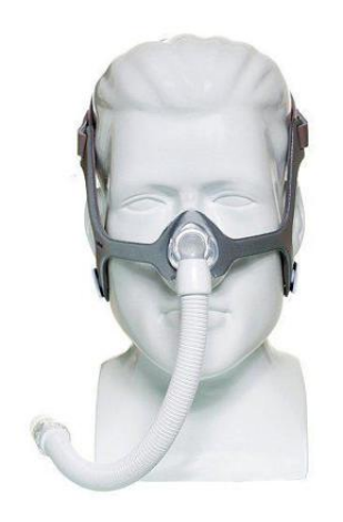
Wisp Complete mask System