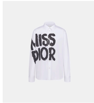
Miss Dior Blouse