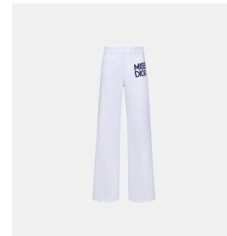
Miss Dior Flared Pant