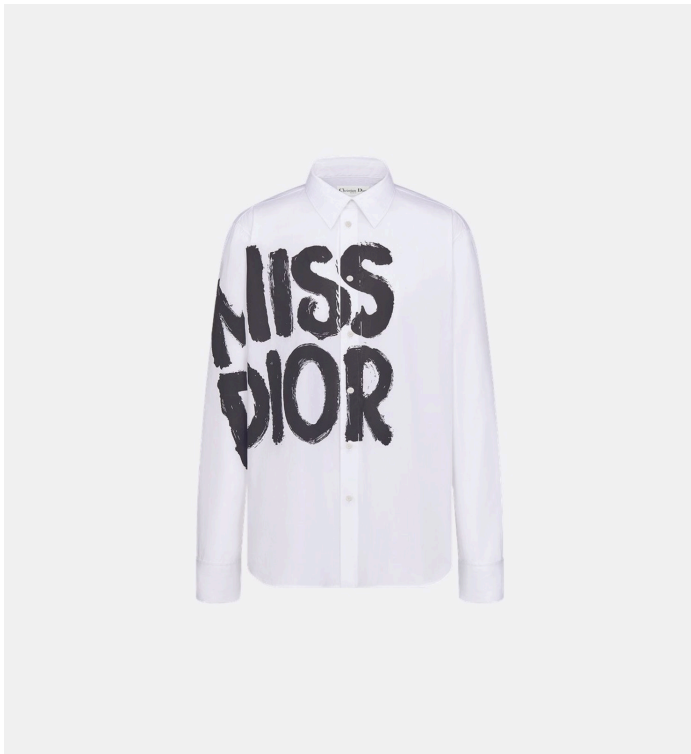
Miss Dior Blouse