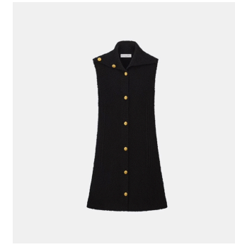
Long Vest Dress