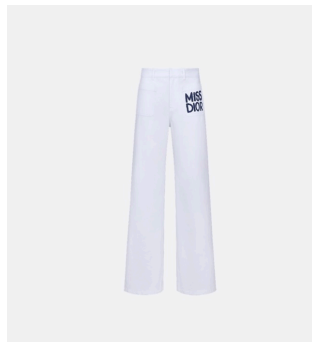
Miss Dior Flared Pant