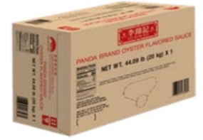
Panda Brand Oyster Flavored Sauce 熊貓牌鮮味蠔油