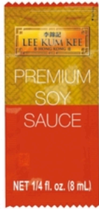
Premium Soy Sauce 特級鮮味生抽