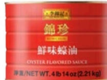
Kum Chun Oyster Flavored Sauce 錦珍鮮味蠔油