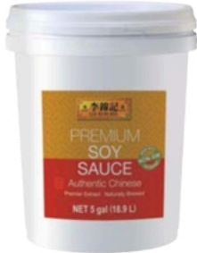
Premium Soy Sauce 特級鮮味生抽