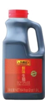
Soy Sauce 鮮味生抽