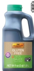
Gluten Free Soy Sauce 無麩質醬油