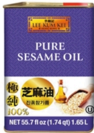
Pure Sesame Oil 極純芝麻油