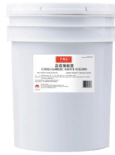
Chili Garlic Sauce (Kosher) 蒜蓉辣椒醬