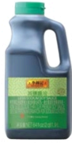
Less Sodium Soy Sauce 減鹽醬油