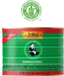
Panda Brand Green Label Oyster Flavored Sauce 熊貓牌綠色新裝蠔油