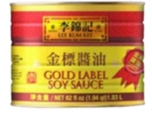
Gold Label Soy Sauce 金標醬油