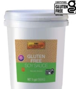
Gluten Free Soy Sauce 無麩質醬油