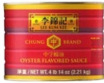
Chung Brand Oyster Flavored Sauce 中字蠔油