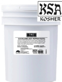
Gochujang (Hot Pepper Paste) 韓國辣醬