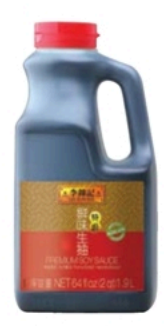
Premium Soy Sauce 特級鮮味生抽