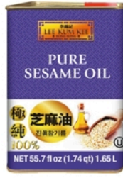
Pure Sesame Oil (Kosher) 極純芝麻油