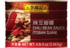
Chili Bean Sauce (Toban Djan) 辣豆瓣醬