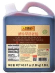
Kum Chun Mushroom Flavored Dark Soy Sauce 錦珍草菇老抽