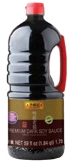
Premium Dark Soy Sauce 特級老抽