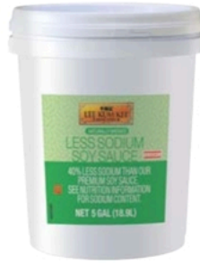
Less Sodium Soy Sauce 減鹽醬油