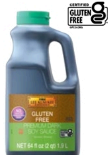
Gluten Free Premium Dark Soy Sauce 無麩質特級老抽