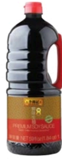
Premium Soy Sauce 特級鮮味生抽