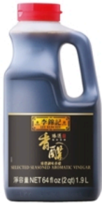
Selected Sesaoned Aromatic Vinegar 臻選調味香醋