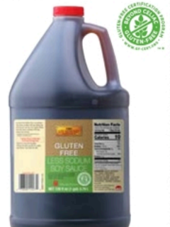
Gluten Free Less Sodium Soy Sauce 無麩質減鹽醬油