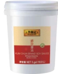
Kum Chun Brand Soy Sauce 錦珍醬油