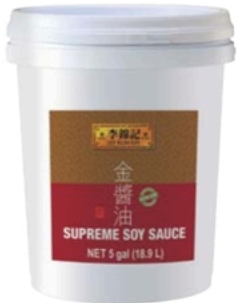
Supreme Soy Sauce 金醬油