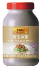
Pure Sesame Paste 純芝麻醬