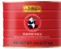
Panda Brand Oyster Flavored Sauce 熊貓牌鮮味蠔油