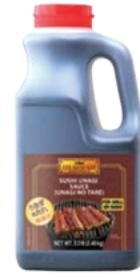
Sushi Unagi Sauce (Unagi No Tare) 鰻魚汁