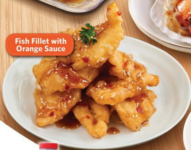
Fish Fillet with Orange Sauce