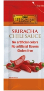
Sriracha Chili Sauce 是拉差辣椒醬