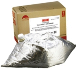
Thai Sweet Chili Sauce (Kosher) 泰式辣甜醬