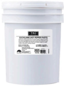
Gochujang (Hot Pepper Paste) (Kosher) 韓國辣醬