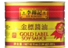
Gold Label Soy Sauce 金標醬油