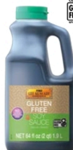
Gluten Free Soy Sauce 無麴質醬油