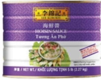
Hoisin Sauce 海鮮醬