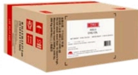
Chili Oil 辣椒油