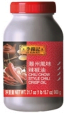
Chiu Chow Style Chili Crisp Oil 潮州風味辣椒油