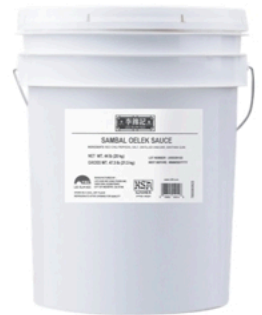
Sambal Oelek Sauce (Kosher) 素辣椒醬