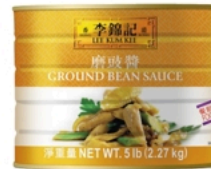
Ground Bean Sauce 磨豉醬