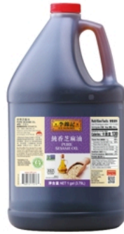
Pure Sesame Oil (Kosher) 純香芝麻油