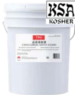
Chili Garlic Sauce 蒜蓉辣椒醬