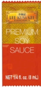
Premium Soy Sauce 特級鮮味生抽