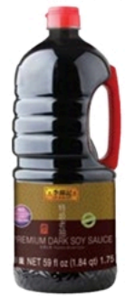
Premium Dark Soy Sauce 特級老抽