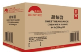
Sweet Bean Sauce (Tien Mien Jiang) 甜麵醬