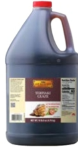
Teriyaki Glaze 照燒淋醬