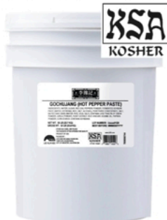
Gochujang (Hot Pepper Paste) 韓國辣醬