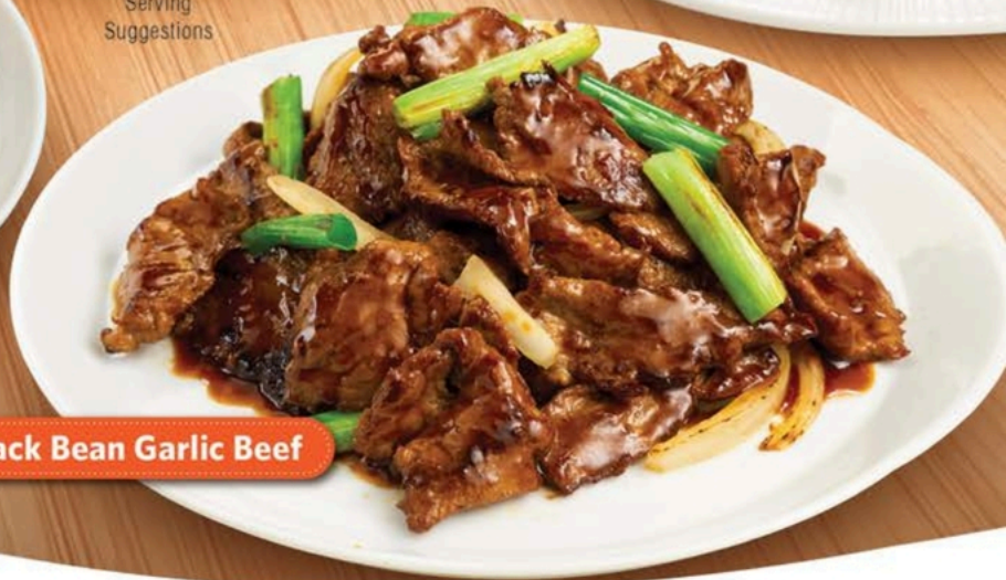
Black Bean Garlic Beef