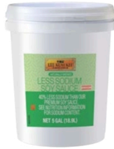
Less Sodium Soy Sauce 減鹽醬油