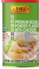
Premium Bouillon Powder Flavored with Chicken 特級調味雞粉

No MSG Added*, Except Naturally Occurring in Yeast Extracts And Poultry Ingredients (Dehydrated Chicken Meat and Chicken Fat)