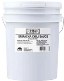
Sriracha Chili Sauce 是拉差辣椒醬