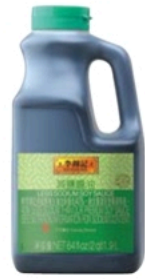
Less Sodium Soy Sauce 減鹽醬油