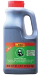
Panda Brand Green Label Oyster Flavored Sauce 熊貓牌綠色新裝蠔油