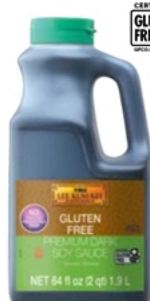
Gluten Free Premium Dark Soy Sauce 無麴質特級老抽