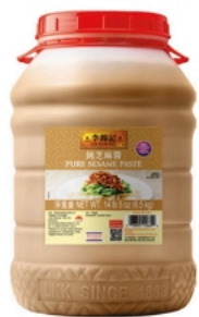
Pure Sesame Paste 純芝麻醬