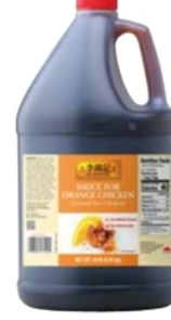
Sauce for Orange Chicken 香橙雞醬