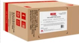
Thai Sweet Chili Sauce 泰式辣甜醬