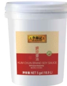
Kum Chun Brand Soy Sauce 錦珍醬油