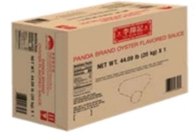
Panda Brand Oyster Flavored Sauce 熊貓牌鮮味蠔油