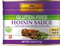
Gluten-Free Hoisin Sauce 無麩質海鮮醬