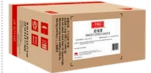
Sweet Chili Sauce 辣甜醬