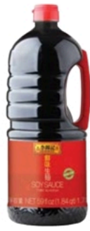
Soy Sauce 鮮味生抽