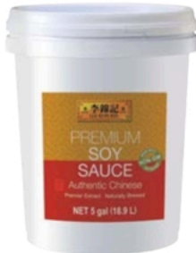
Premium Soy Sauce 特級鮮味生抽