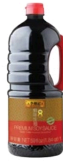
Premium Soy Sauce 特級鮮味生抽