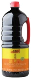
Seasoning Soy Sauce 味極鮮特級醬油