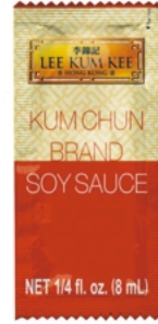
Kum Chun Brand Soy Sauce 錦珍醬油