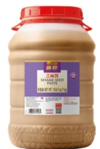
Kum Chun Sesame Seed Paste 錦珍芝麻醬