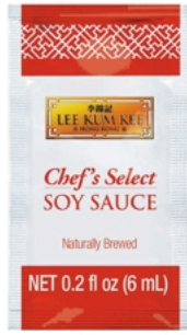
Chef's Select Soy Sauce 廚師精選醬油