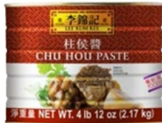
Chu Hou Paste 柱侯醬