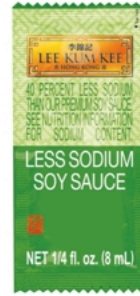
Less Sodium Soy Sauce 減鹽醬油