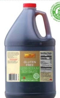
Gluten Free Less Sodium Soy Sauce 無麴質減鹽醬油