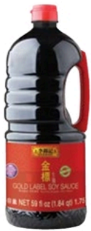
Gold Label Soy Sauce 金標生抽