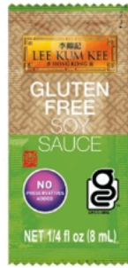
Gluten Free Soy Sauce 無麩質醬油