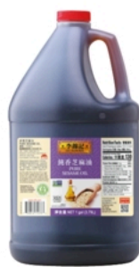
Pure Sesame Oil 純香芝麻油