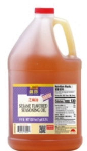
Kum Chun Sesame Flavored Seasoning Oil 錦珍芝麻油