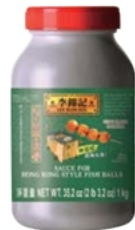
Sauce for Hong Kong Style Fish Balls 港式街頭魚蛋醬