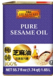
Pure Sesame Oil 極純芝麻油