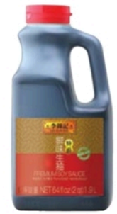
Premium Soy Sauce 特級鮮味生抽