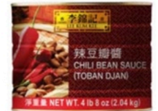
Chili Bean Sauce (Toban Djan) 辣豆瓣醬