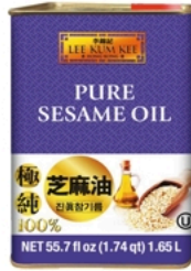
Pure Sesame Oil (Kosher) 極純芝麻油