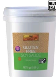
Gluten Free Soy Sauce 無麴質醬油