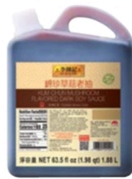
Kum Chun Mushroom Flavored Dark Soy Sauce 錦珍草菇老抽