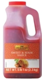
Sweet & Sour Sauce 甜酸醬