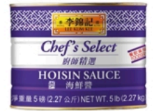
Chef's Select Hoisin Sauce 廚師精選海鮮醬