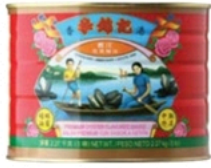
Premium Oyster Sauce 舊庄特級蠔油