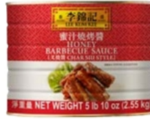
Honey Barbecue Sauce (Char Siu Style) 蜜汁燒烤醬 (叉燒醬)