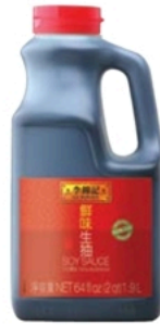
Soy Sauce 鮮味生抽