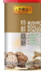
Mushroom Bouillon Powder 特鮮菇粉