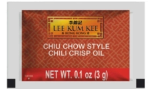
Chiu Chow Style Chili Crisp Oil 潮州風味辣椒油