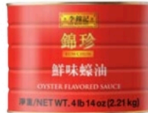
Kum Chun Oyster Flavored Sauce 錦珍鮮味蠔油