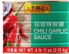
Chili Garlic Sauce 蒜蓉辣椒醬