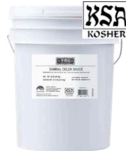
Sambal Oelek Sauce 素辣椒醬