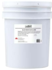
Black Bean Garlic Sauce 蒜蓉豆豉醬