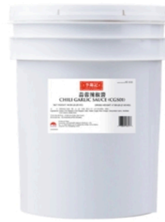
Chili Garlic Sauce (Kosher) 蒜蓉辣椒醬