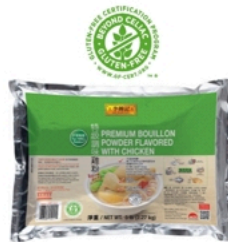
Premium Bouillon Powder Flavored with Chicken 特級調味雞粉

No MSG Added*, Except Naturally Occurring in Yeast Extracts And Poultry Ingredients (Dehydrated Chicken Meat and Chicken Fat)