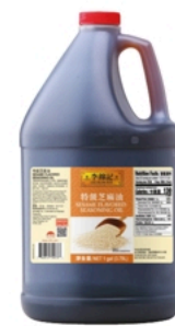
Sesame Flavored Seasoning Oil 特級芝麻油