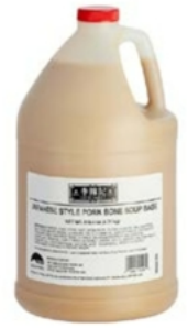
Japanese Style Pork Bone Soup Base 日式豬骨濃湯