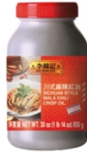
Sichuan Style Mala Chili Crisp Oil 川式麻辣紅油