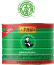
Panda Brand Green Label Oyster Flavored Sauce 熊貓牌綠色新裝蠔油