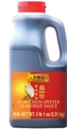
Kum Chun Oyster Flavored Sauce 錦珍鮮味蠔油