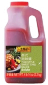
Thai Style Sweet Chili Sauce 泰式辣甜醬