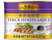
Thick Hoisin Sauce 香濃海鮮醬