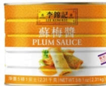
Plum Sauce 蘇梅醬