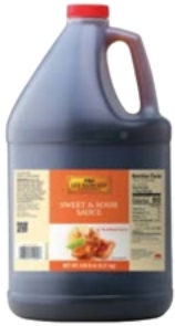
Sweet & Sour Sauce 甜酸醬