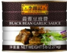
Black Bean Garlic Sauce 蒜蓉豆豉醬