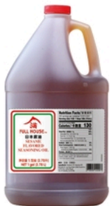
Full House Sesame Flavored Seasoning Oil Full House 日本麻油