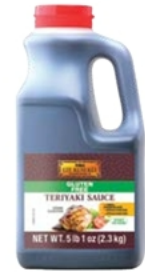
Gluten Free Teriyaki Sauce 無麩質照燒汁