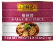
Mala Chili Sauce 麻辣醬