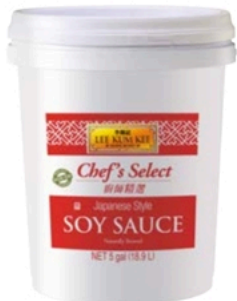
Chef's Select Soy Sauce 廚師精選醬油