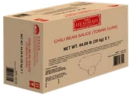
Chili Bean Sauce (Toban Djan) 辣豆瓣醬