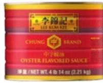
Chung Brand Oyster Flavored Sauce 中字蠔油