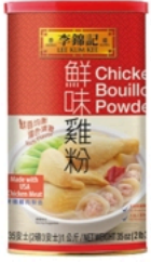
Chicken Bouillon Powder 鮮味雞粉