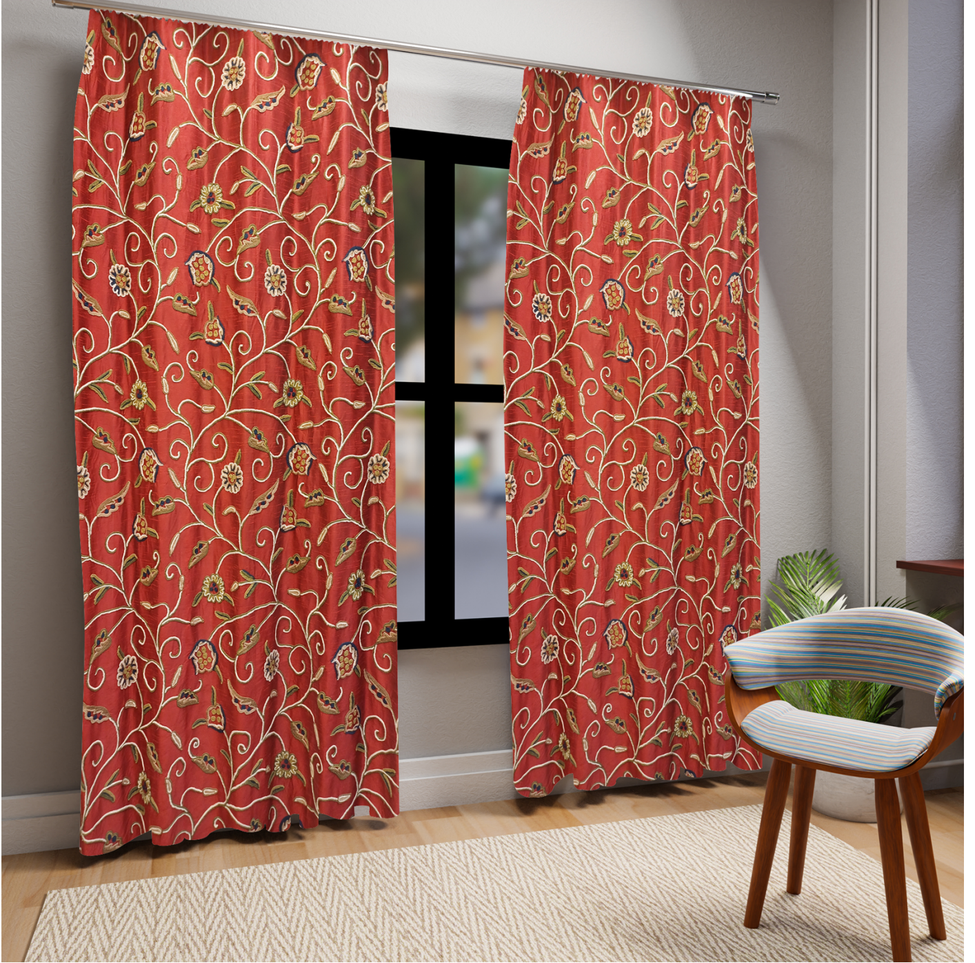
DUPION MAROON SOSNIDAR