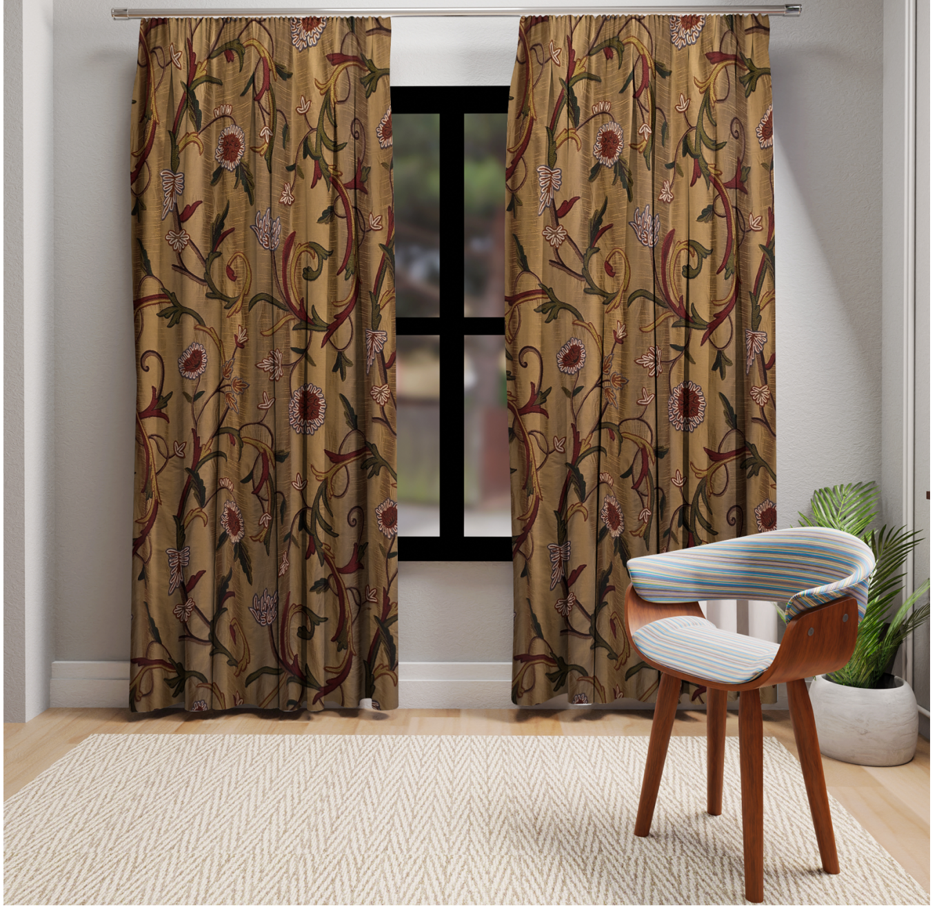
DUPION BROWN GADDADAR