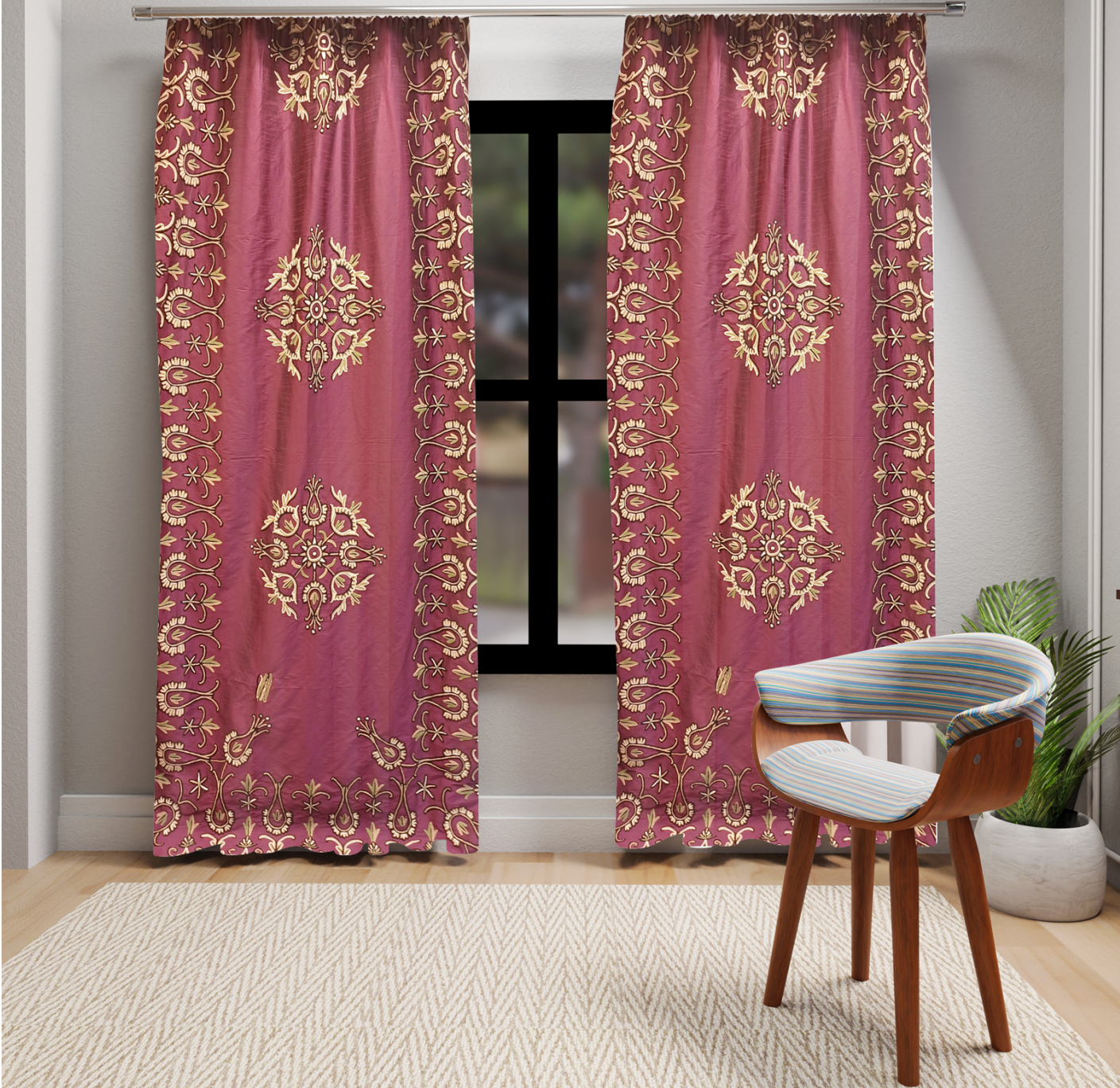
DUPION WINE TRAMIDAR