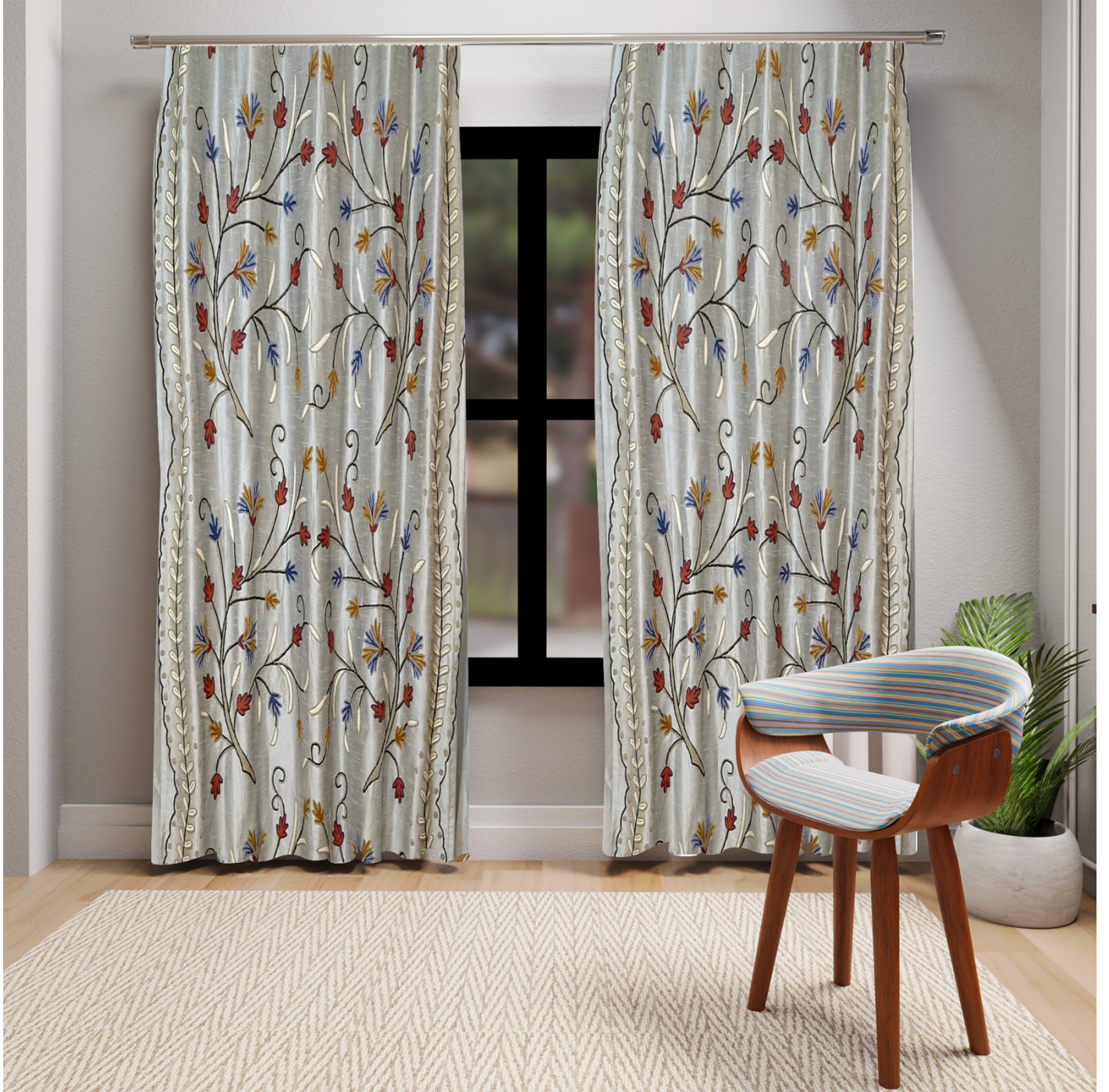
DUPION GREY LINEDAR