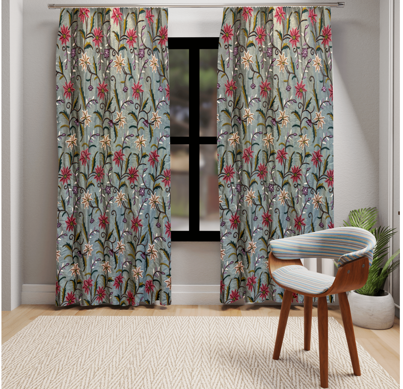
DUPION GREEN SOSNIPOSH