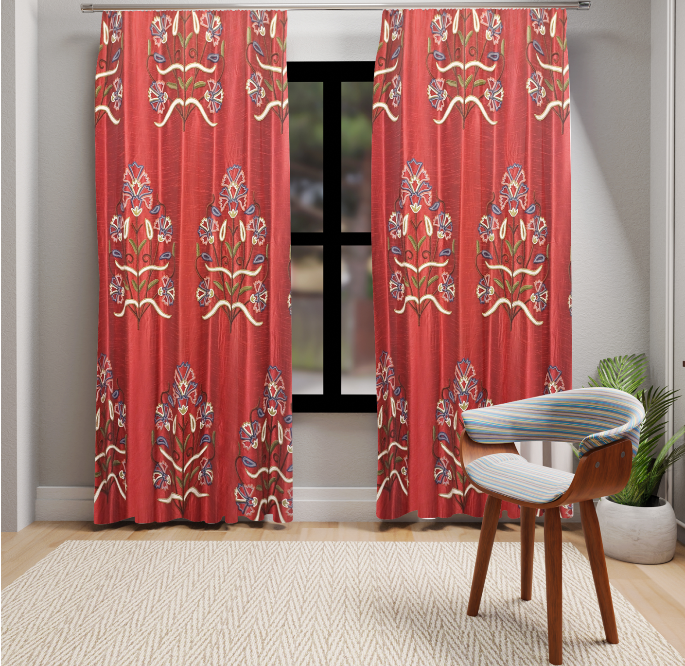
DUPION RED BOUQUET