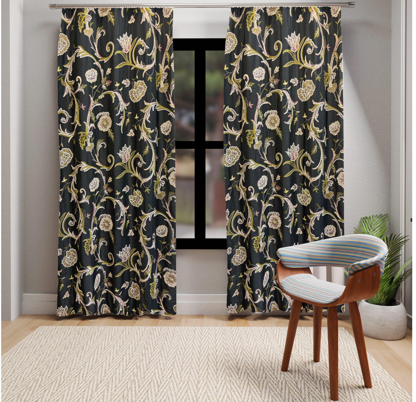
DUPION BLACK GADDADAR