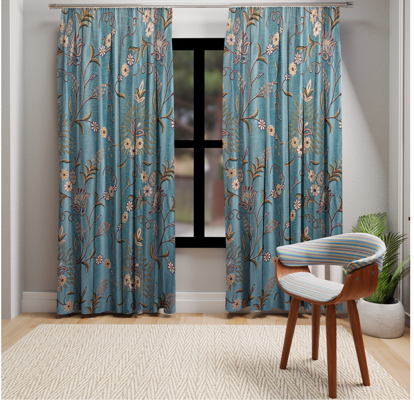
DUPION BLUE DASHIDAR