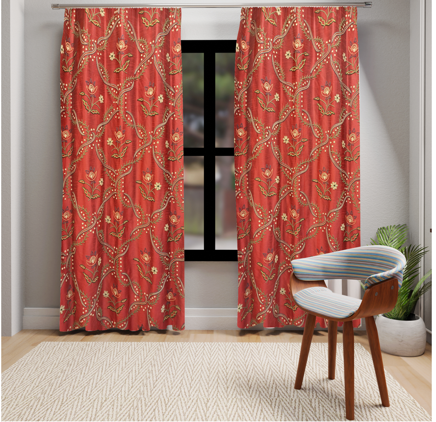
DUPION MAROON MALADAR