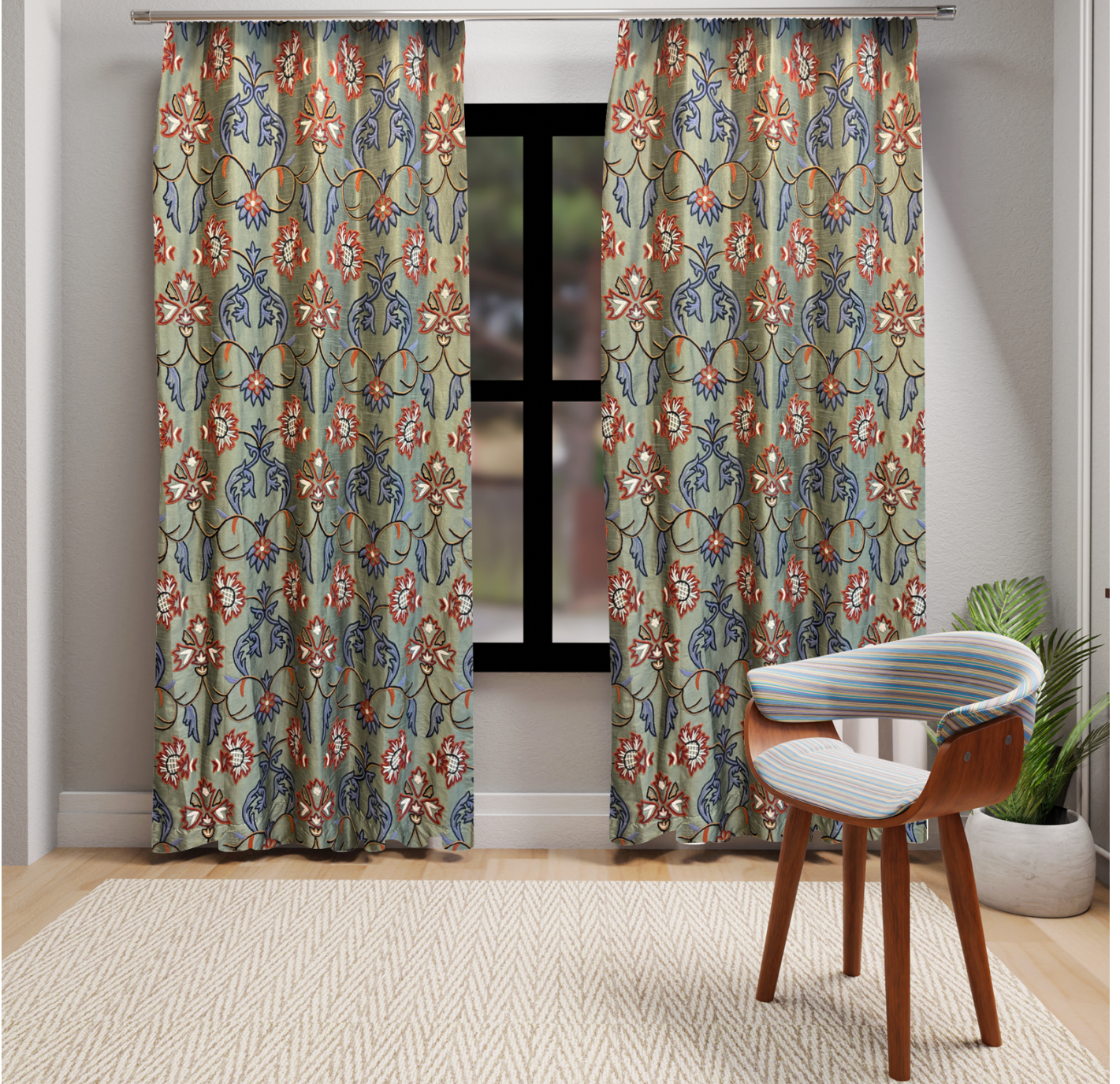
DUPION GREEN TAMBOLA