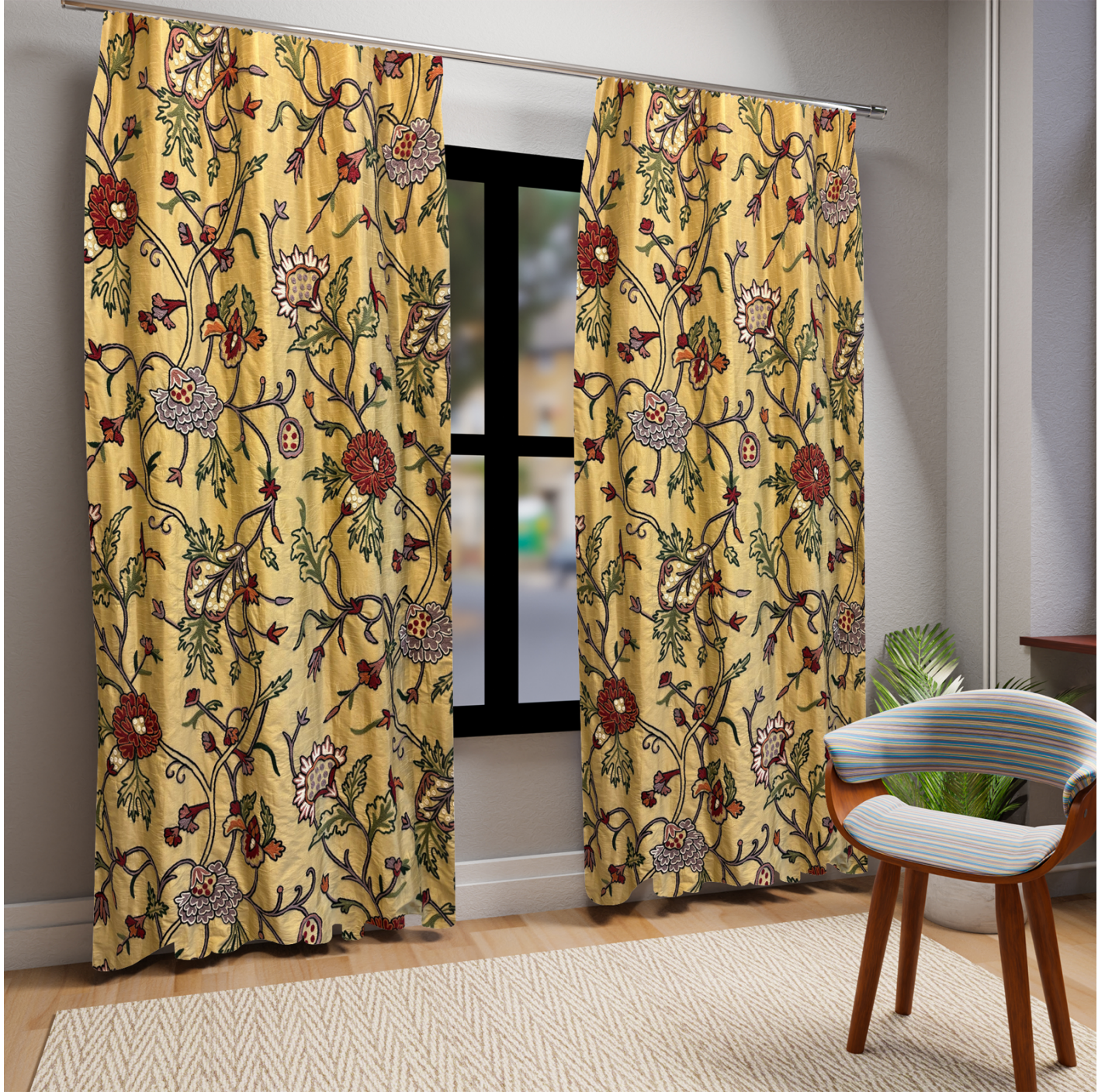
DUPION BEIGE NEW WATLAB