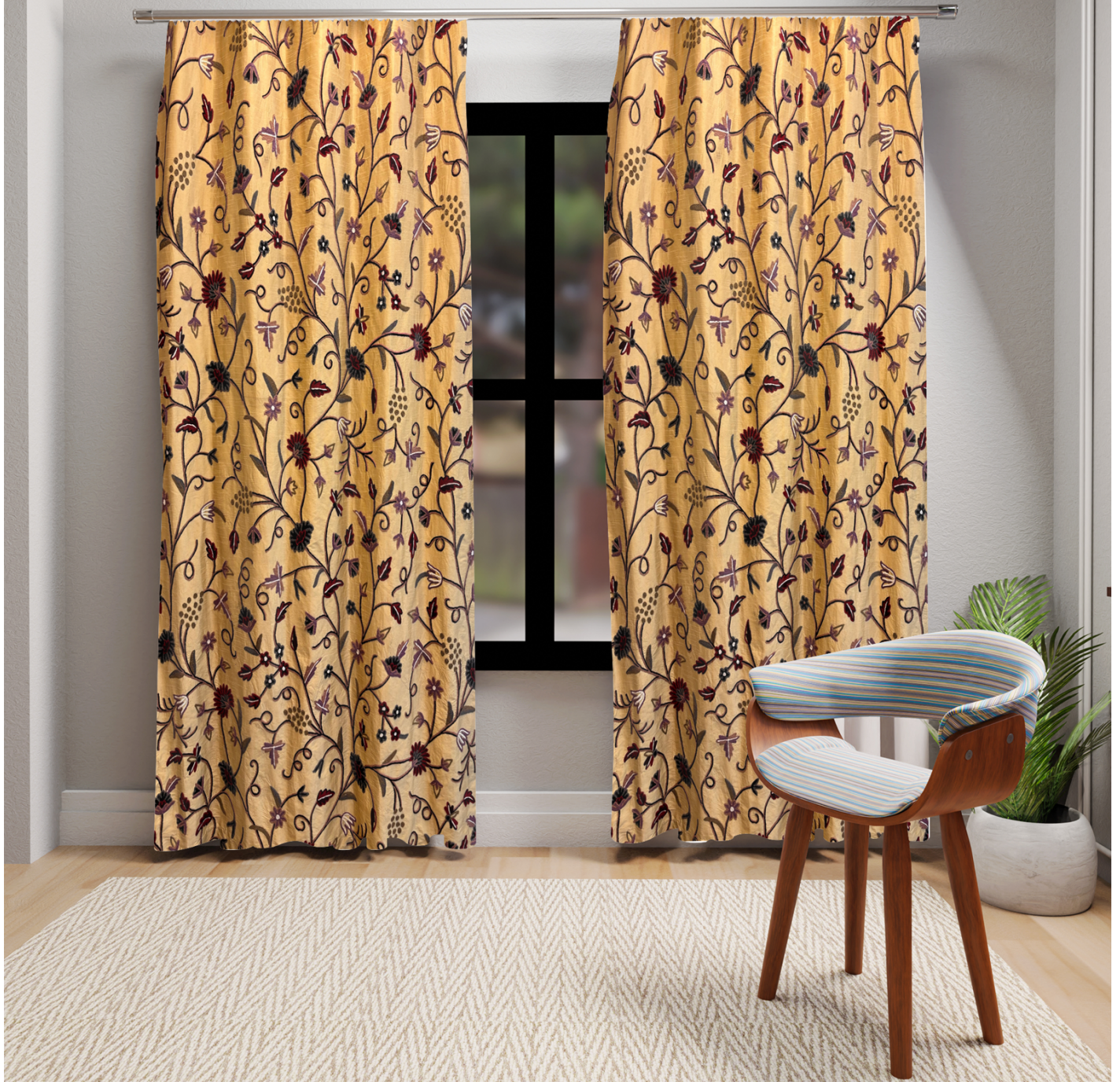
DUPION BEIGE GRAPES