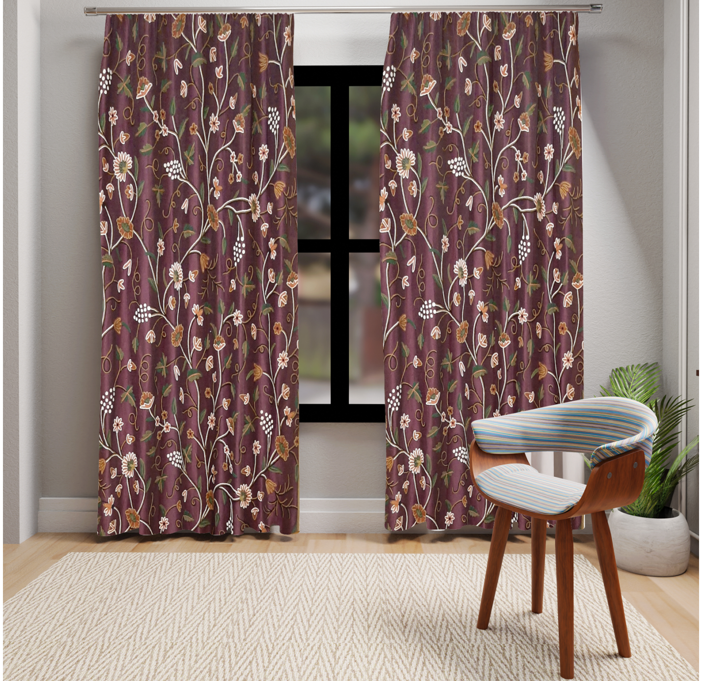
DUPION WINE GRAPES