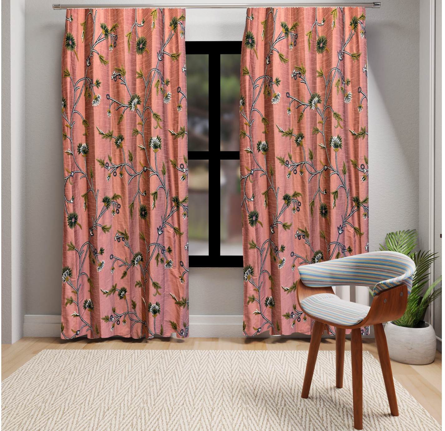
DUPION PINK WINTERTIME