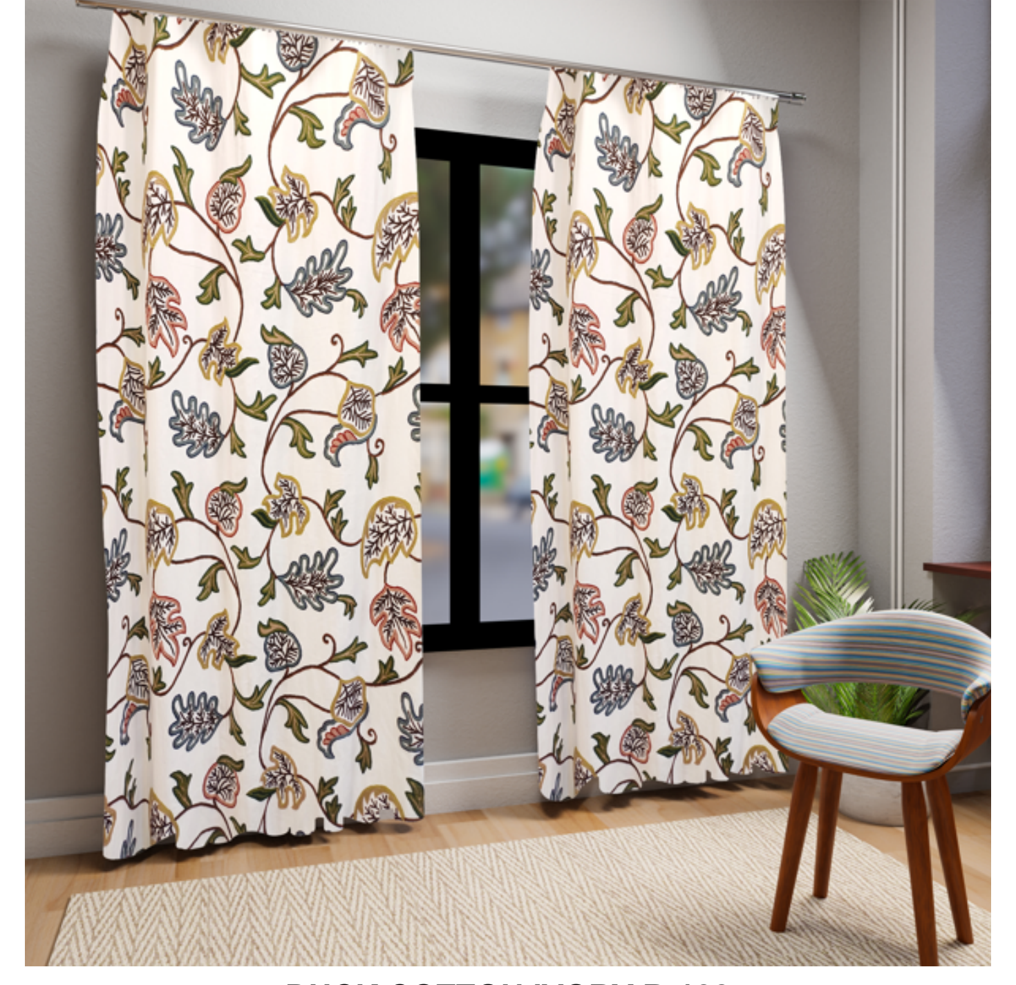
DUCK COTTON IVORY R-122