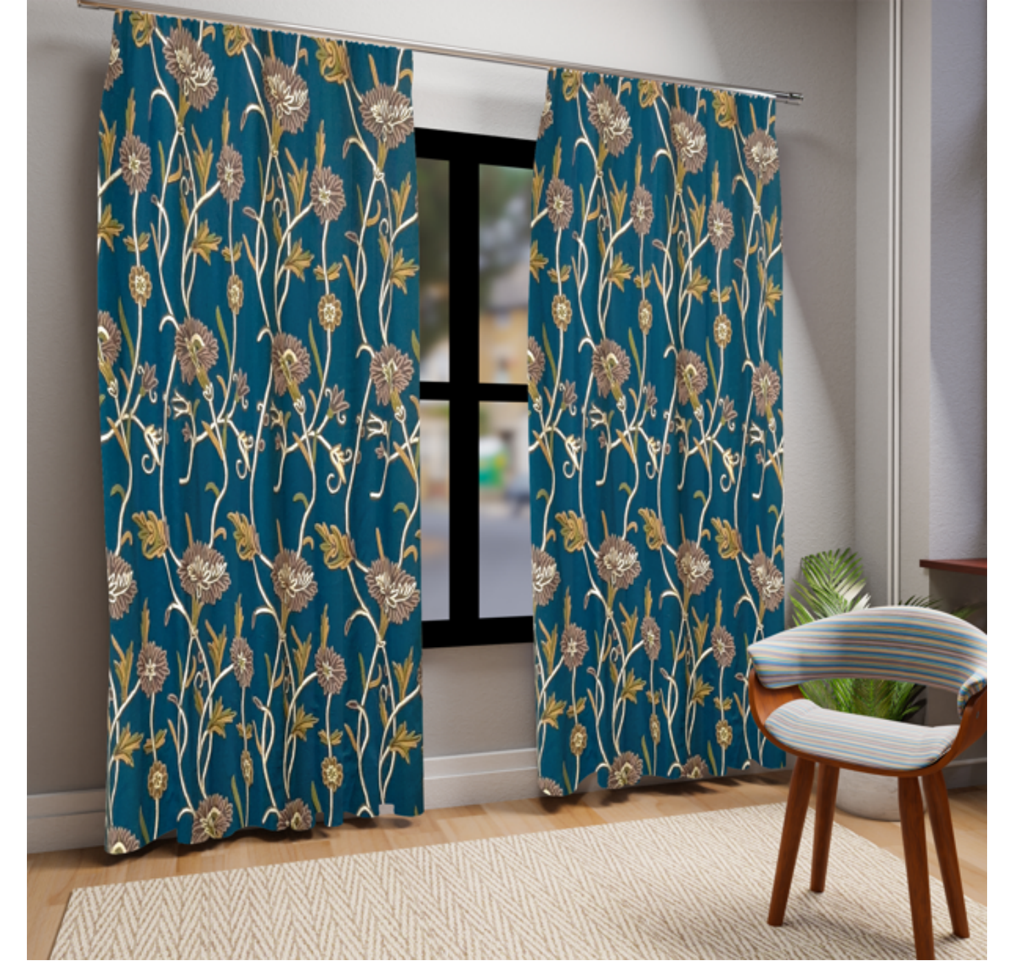
DUCK COTTON BLUE TULIP