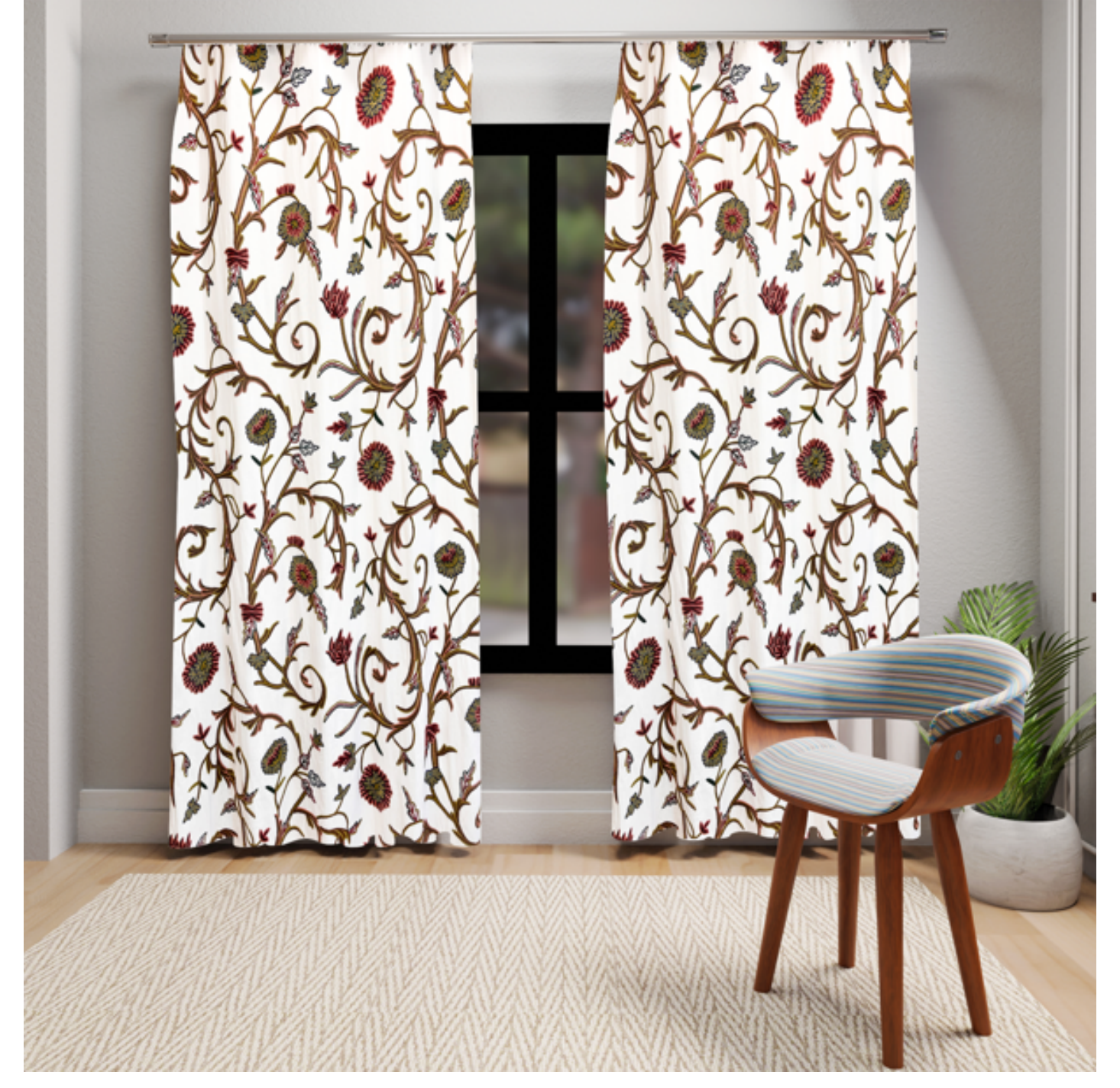
DUCK COTTON IVORY GADDADAR