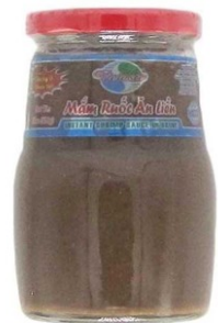
81163: VTASTE 24/430g SHRIMP SAUCE READY S

FISH SAUCE PREP/VEG 12*(VTASTE 12/650mL) 80182