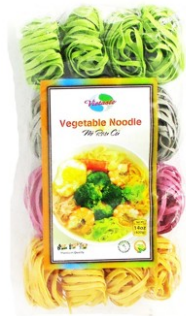
16118: VTASTE 30/14oz DRIED NOODLE PREMIUM 100% VEGGIES