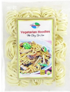
16116: VTASTE 30/14oz DRIED NOODLE SQUARE THIN