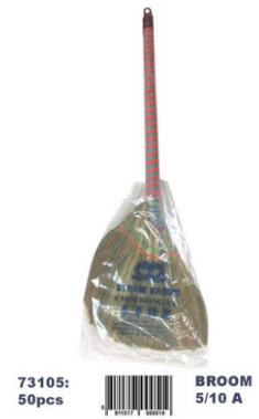
73105: 50pcs BROOM 5/10 A