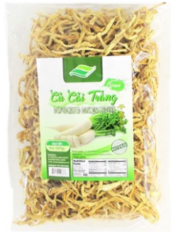
38309: SONACO 30/8oz DRIED RADISH 30/8oz