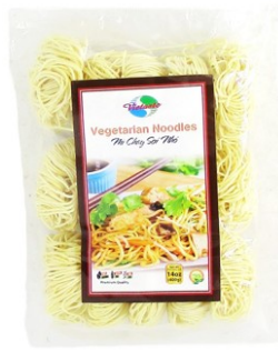
16117: VTASTE 30/14oz DRIED NOODLE ROUND THIN