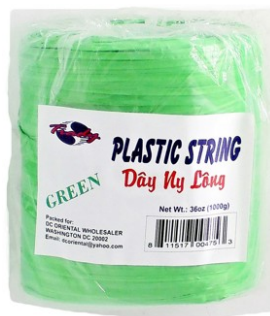
73123: VN 12/1KG PLASTIC STRING GREEN