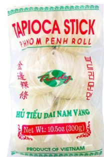
RICE STICK NV/LONG (TRADY 30/10.5oz) 11163

11164: TRADY 30/10.5oz RICE STICK NV ROLL 30/10.5oz