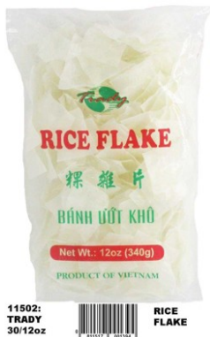
RICE FLAKE 30/12 (TS 30/12oz) 11502