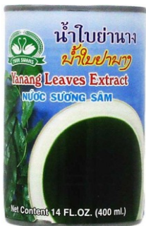
20242: TWIN SWANS 24/14 OZ YANANG JUICE