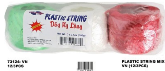
73124: VN 12/3PCS PLASTIC STRING MIX VN (12/3PCS)