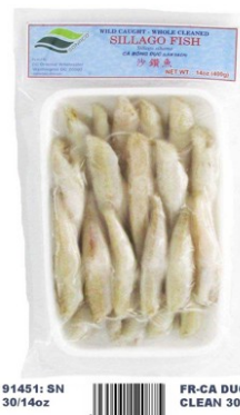
FR-CA DUC CLEAN 30* (SN 30/14oz) 91451