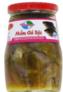
81344: VTASTE 24/430G MAM SAC WHOLE 24/15

MAM LOC XAY 24/14 (VTASTE 24/400G) 81342