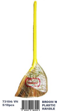
73104: VN 5/10pcs BROOM W PLASTIC HANDLE