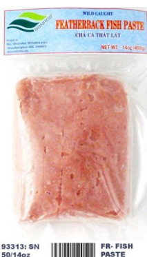
FR-FISH PASTE 50/14 (SN 50/14oz) 93313