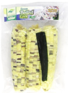
96091: SONACO 16/3PCS FR-CORN BOILED COLOR 16/3PCS