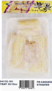
94132: SN TRAY 30/19oz FR-CASSAVA STEAMED