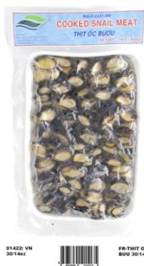
FR-SNAIL MEAT/THIT OC BUU (SN 30/14oz) 91422