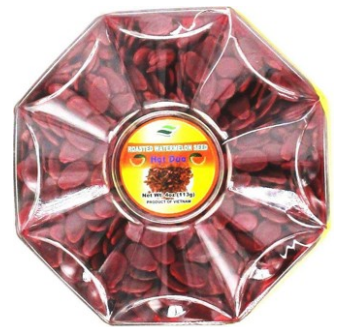
27464: SN 24/4 OZ MELON SEED BOX HAT DUA