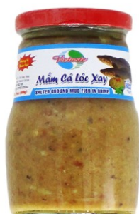
81342: VTASTE 24/400g MAM LOC XAY 24/400g

MAM LOC WHOLE 24/15 (VTASTE 24/430G) 81341