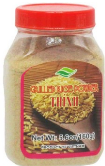
18140: VN 24/5.6oz THINH ROAST RICE JAR