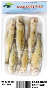
FR-CA BONG CAT/HEADLESS (SN 30/14oz) 91438