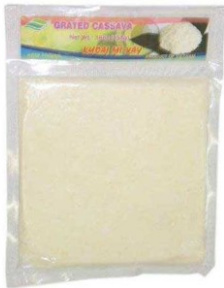
94143: SN 30/16oz FR-GRATED CASSACA