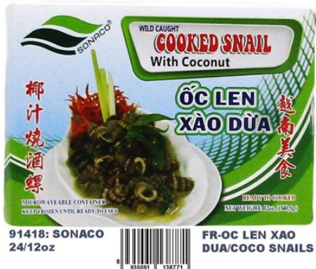
FR-OC LEN DUA/COCO SNAILS (SN 24/12oz) 91418