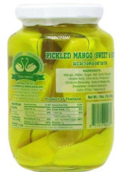
20211: TWIN SWANS 24/16oz PICK MANGO 24/16 SL