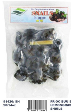
FR-OC BUU SA/LEMONGRASS SNAILS (SN 20/14oz) 91420