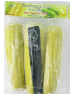
96096: SONACO 16/3PCS FR-CORN BOILED LEAF