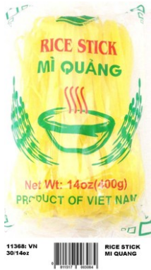
RICE STICK MI QUANG S (SN 30/14oz) 11368