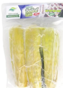
96094: SONACO 16/3PCS FR-CORN COLOR LEAF 16/3PCS