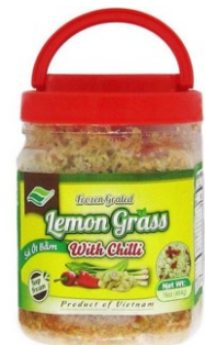
FR-LEM/GRASS 24/7 H (SONACO 24/7oz) 98114