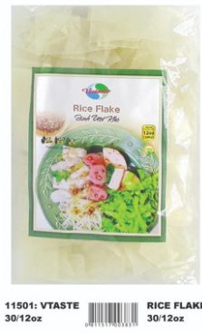
RICE FLAKE 30/12 (VTASTE 30/12oz) 11501