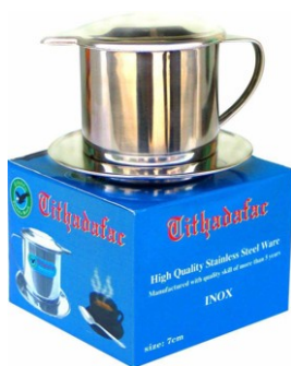
73132: TRADY 30PCS COFFE FILTER 30PCS