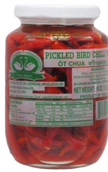
40107: TWIN SWANS 24/16oz PICK CHILI RED WH