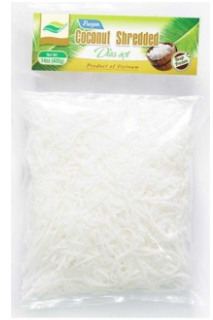
94133: SN 30/7oz FR-COCONUT ST/SOI