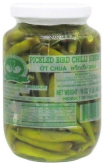
40106: TWIN SWANS 24/16 OZ PICK CHILI GREEN WH