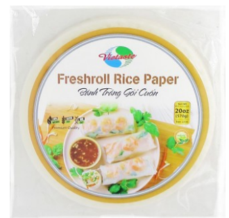
RICE PAPER PRE 22, 24/20 (VTASTE 24/20oz) 12131