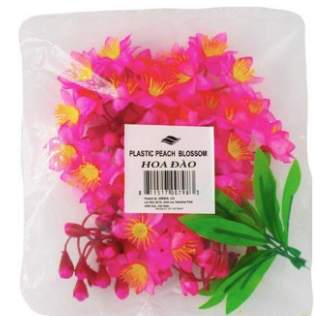
73193: VN 50 BAGS FLOWER/HOA DAO 50 BAGS