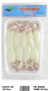
FR-SQUID TUBE 30/12 (SN 30/12oz) 92223