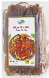
RICE STICK DA CUA (VTASTE 30/14oz) 11505