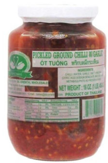
40110: TWIN SWANS 24/16oz PICK CHILI GARLIC GROUND