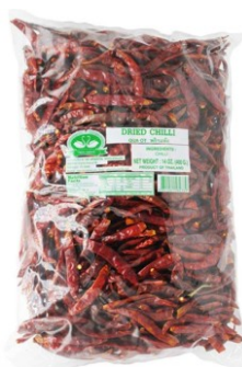
40507: TWIN SWANS 30/14oz DRIED CHILI 30/14oz