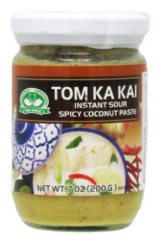
41109: TWIN SWANS 24/7oz TOM KHA PASTE 7oz