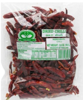
40503: TWIN SWANS 50/3.5oz DRIED CHILI 50/3.5oz