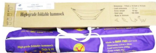
73182: VN 1 SET HAMMOCK SET LARGE