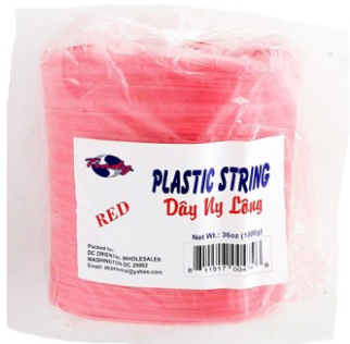
73122: VN 12/1KG PLASTIC STRING RED