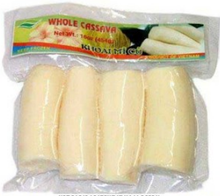
94130: SN 30/16oz FR-CASSAVA WH 30/16oz