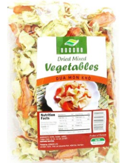
38312: SONACO 24/8oz DRIED MIXED VEGIE 24/8oz