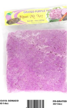
FR-GRATED YAM 30/14 (SONACO 30/14oz) 93418