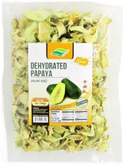
38308: SONACO 30/5oz DRIED PAPAYA 130/5oz