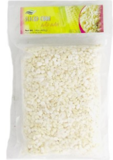
96090: SN 30/14oz FR-CORN SLICE