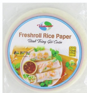
RICE PAPER PRE 22, 40/12 (VTASTE 40/12oz) 12130