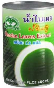
20203: TWIN SWANS 24/14oz PANDAN JUICE 24/14