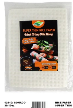
RICE PAPER/SUPER THIN (SN 30/10oz) 12110