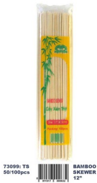
73099: TS 50/100pcs BAMBOO SKEWER 12"