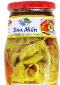
PRES RADISH VEGE DUA MON CHAY 24/14 (VTASTE 24/14OZ) 45251