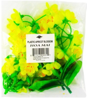
73194: VN 50BAGS FLOWER/HOA MAI 50BAGS