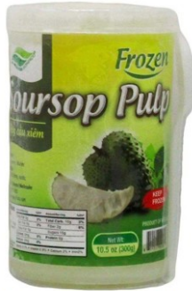
95113: SONACO 24/10.5oz FR-SOURSOP