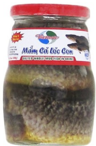
81341: VTASTE 24/430g MAM LOC WHOLE 24/15oz

MAM RUOC READY TO EAT (VTASTE 24/430G) 81163