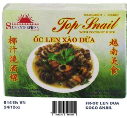
FR-OC LEN DUA/COCO SNAIL (VN 24/12oz) 91419