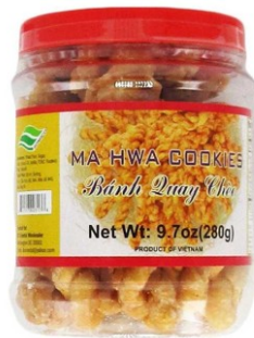
26436: VN 24/9.7oz MA HWA COOKIES