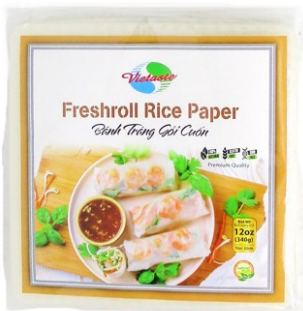
RICE PAPER PRE 22 SQUARE (VTASTE 40/12oz) 12121