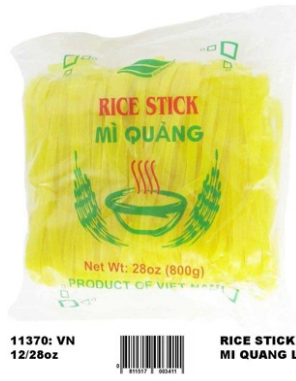
RICE STICK MI QUANG L (SN 12/28oz) 11370