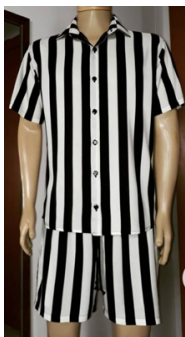
Two piece male wear