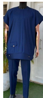
Male senator wear