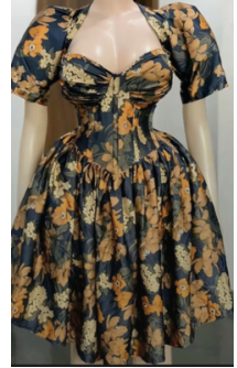
Asymmetric printed dress