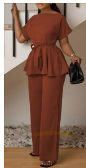
Two pieces ladies wear