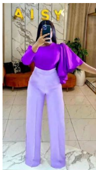
Two piece ladies wear