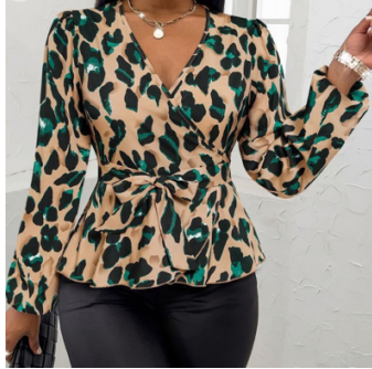
Ladies Top / Blouse