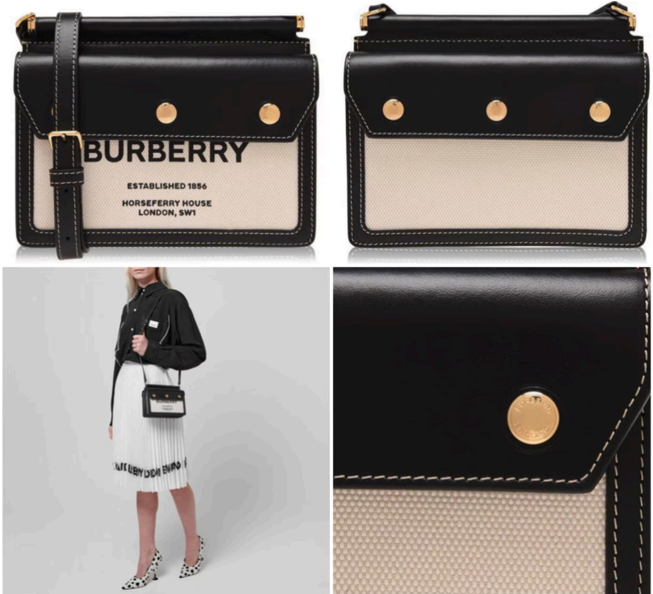
BURBERRY BURBERRY BABY TITLE BAG NAT BLK