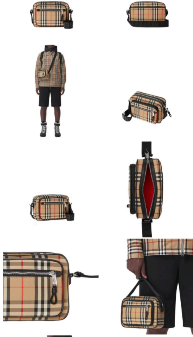
BURBERRY VINTAGE CHECK LEATHER CROSSBODY BAG VINT CHECK