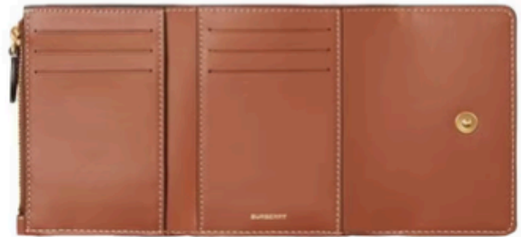
BURBERRY BURB LANCASTER PURSE