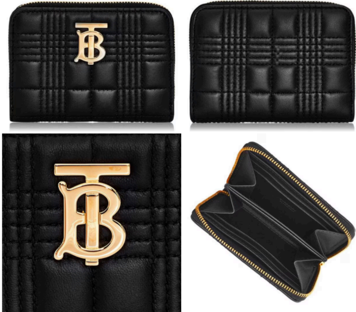
BURBERRY BURBERRY LOLA ZIP AROUND PURSE BLK