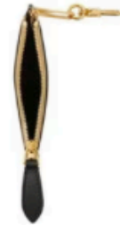
BURBERRY KELBROOK KEY POUCH