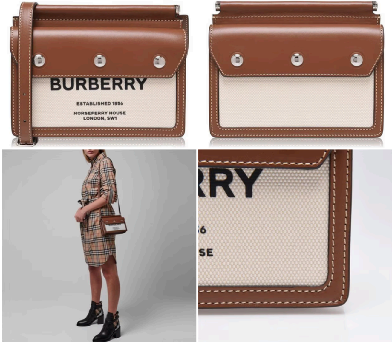
BURBERRY BURBERRY BABY TITLE BAG NAT MALT