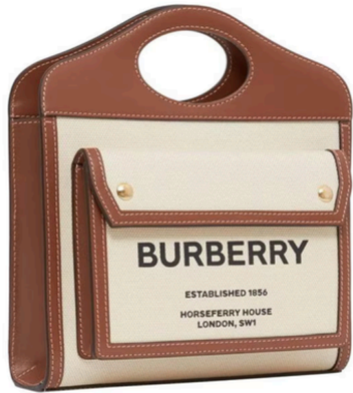
BURBERRY POCKET MINI HANDBAG MALT BROWN