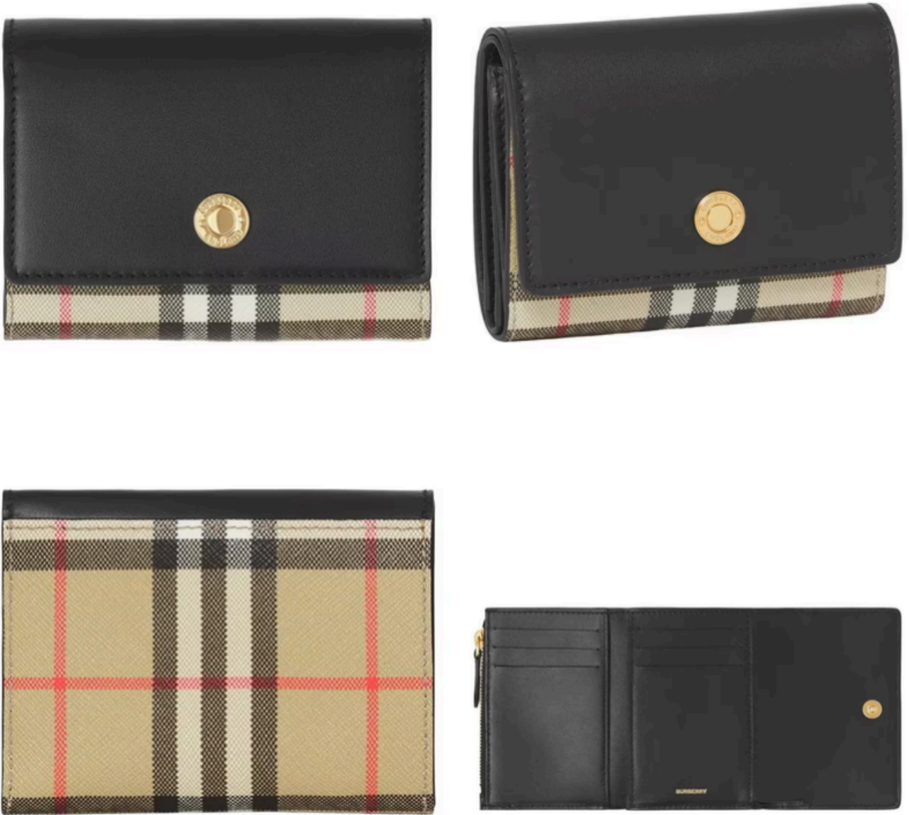
BURBERRY LANCASTER PURSE BLK