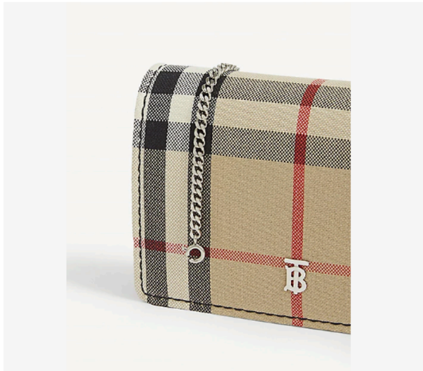
BURBERRY JESSIE WOC