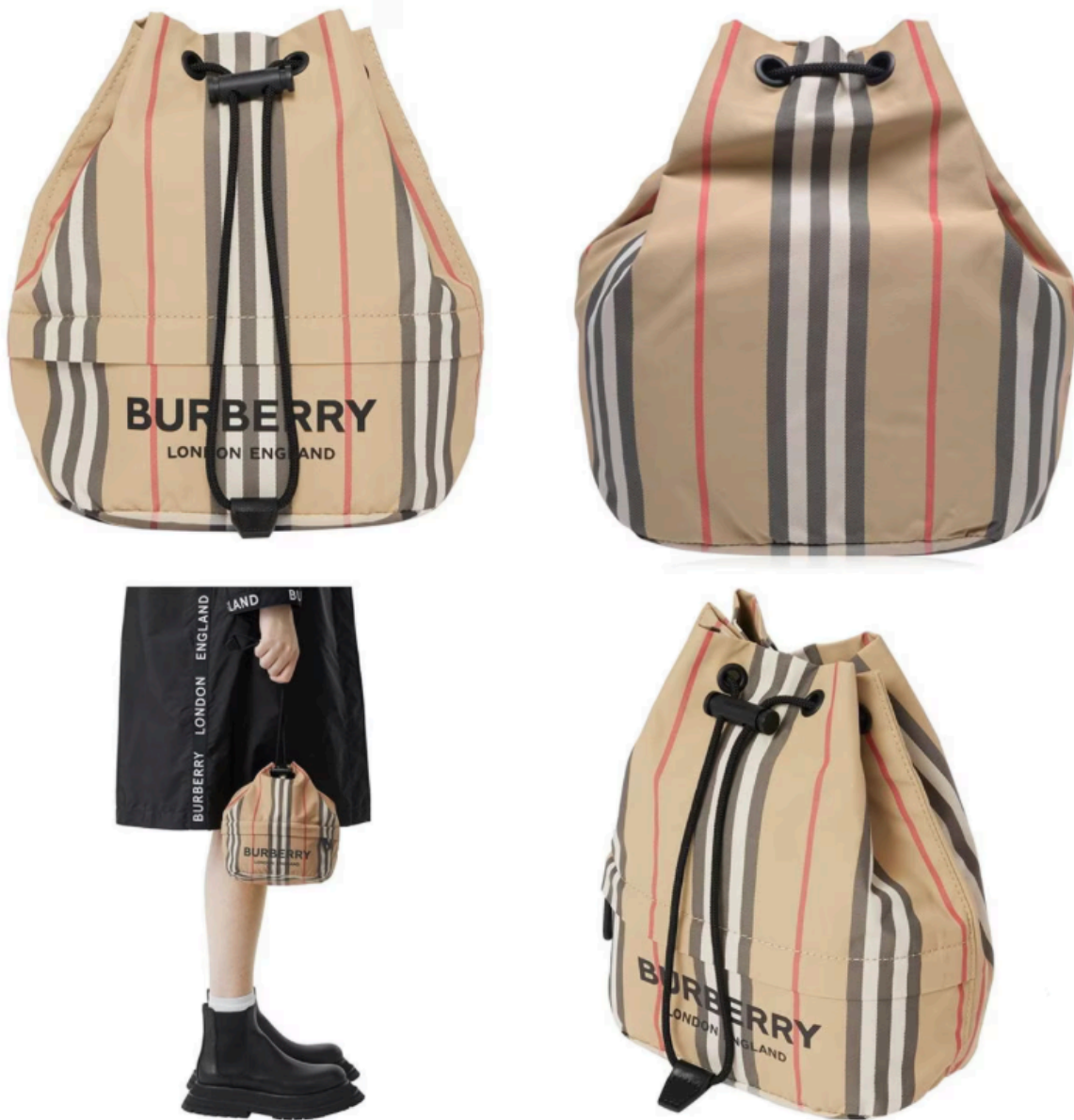
BURBERRY LOGO PRINT NYLON DRAWCORD POUCH ARC BEIGE