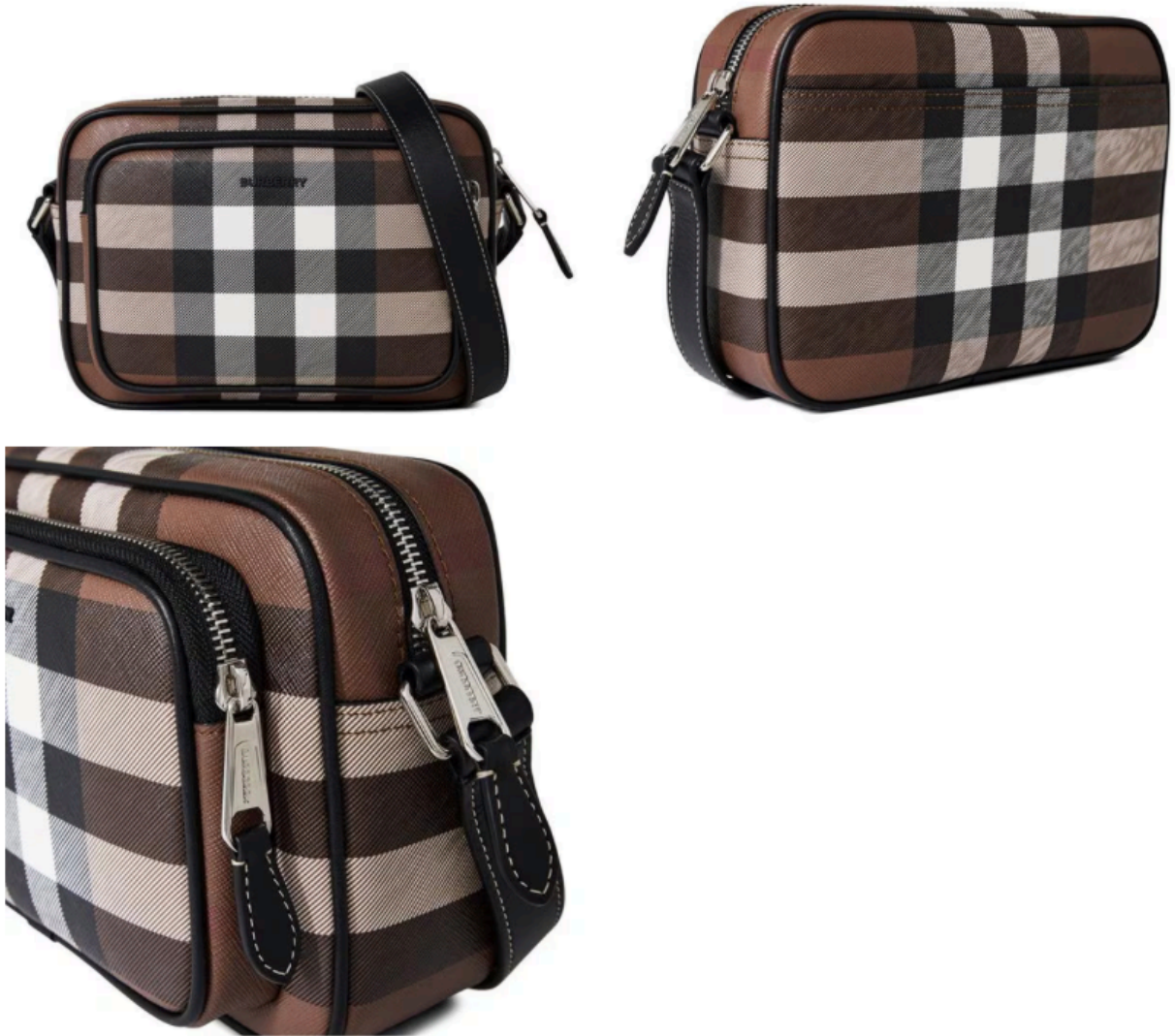
BURBERRY PADDY CHECK CAMERA BAG BIRCH BROWN