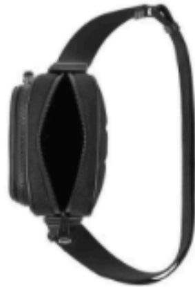
BURBERRY MESH FRED BAG