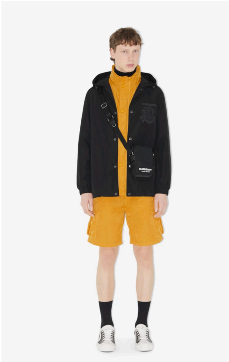
BURBERRY Vertical Paddy NYLON Bag BLACK