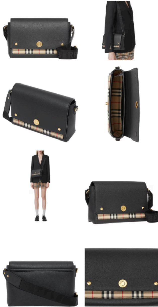
BURBERRY LEATHER AND VINTAGE CHECK NOTE CROSSBODY BAG