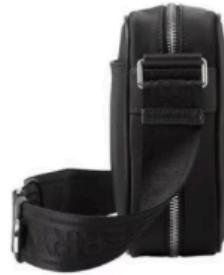
BURBERRY SQUARE PADDY CROSS BODY BAG BLK SQUARE