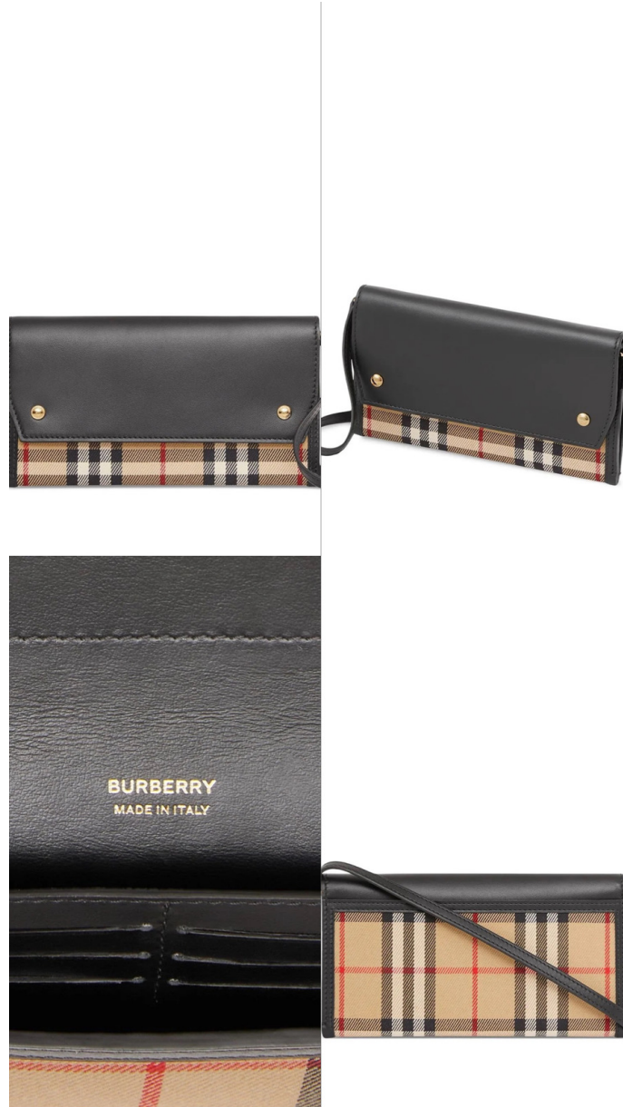
BURBERRY BURBERRY PHONE POCKET ARC BEIGE