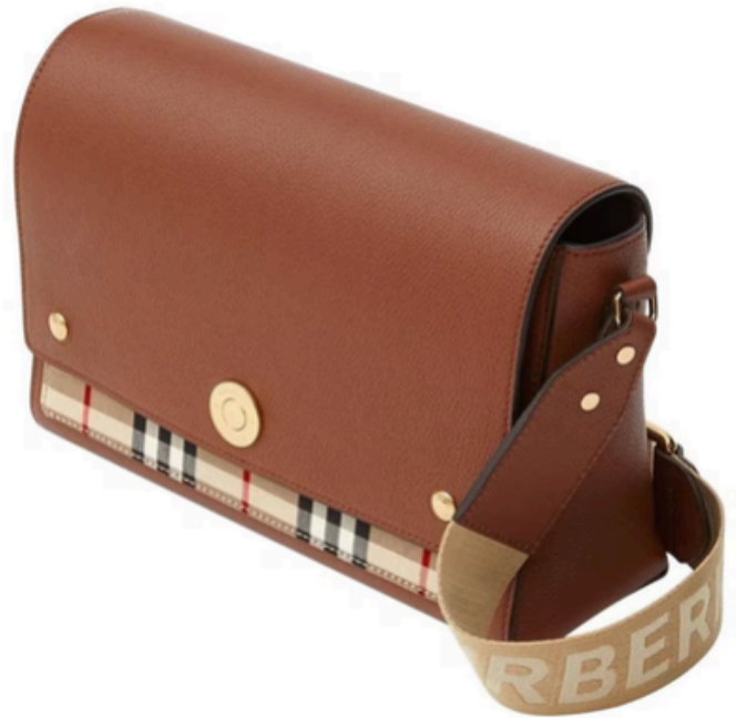
BURBERRY MEDIUM NOTE BAG TAN