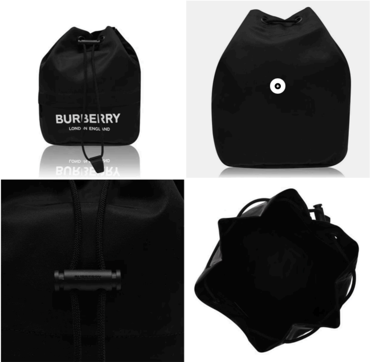
BURBERRY LOGO PRINT NYLON DRAWCORD POUCH BLACK