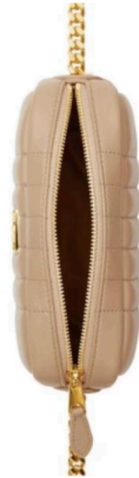
BURBERRY BURB LOLA CAMERA BAG OATY