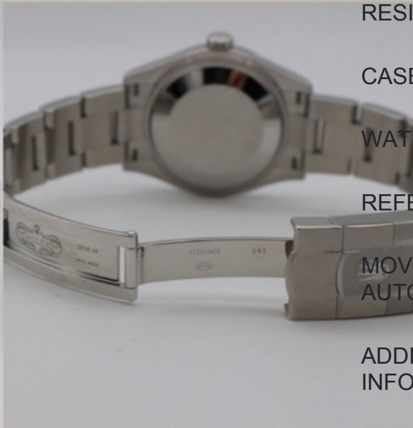
ROLEX OYSTER PERPETUAL "TIFFANY" 31 620,000