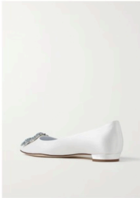
MANOLO BLAHNIK Hangisiflat crystal-embellished satin point-toe flats WHITE