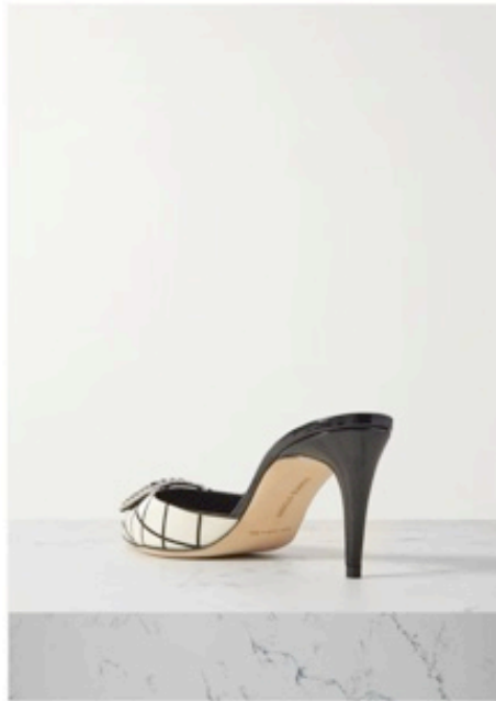
MANOLO BLAHNIK Latexamu 70 embellished flocked satin mules