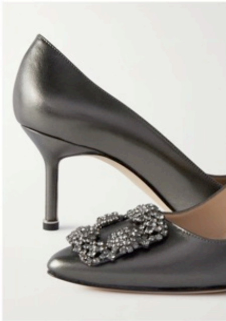
MANOLO BLAHNIK Hangisi 70 embellished metallic leather pumps METTALIC