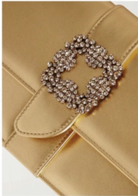
MANOLO BLAHNIK Capri Long crystal-embellished metallic leather clutch GOLD