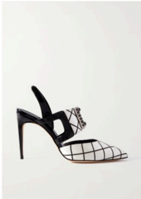
MANOLO Bimixpla 105 buckled checked satin and patent-leather slingback pumps