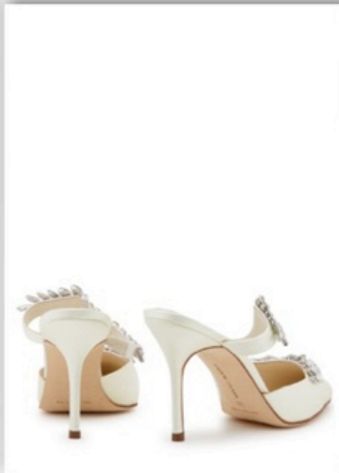
MANOLO BLAHNIK Lurum 90 embellished satin mules WHITE