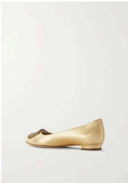
MANOLO BLAHNIK Hangisi embellished metallic leather point-toe flats GOLD