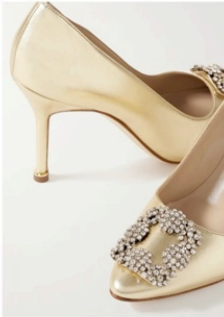
MANOLO BLAHNIK Hangisi 90 embellished metallic leather pumps GOLD 42,000