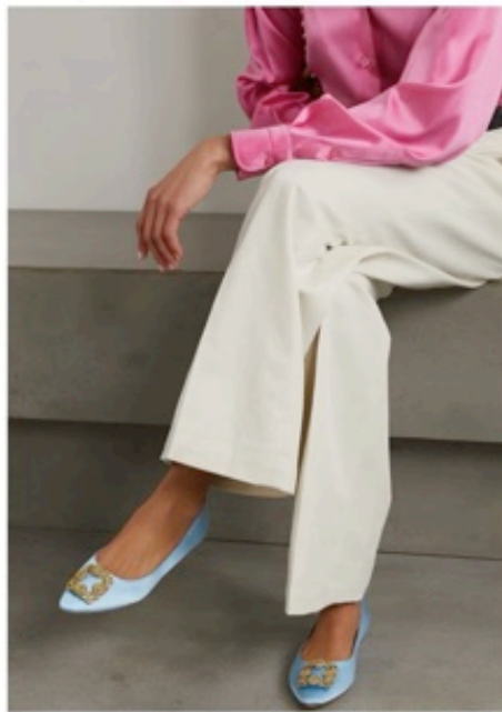
MANOLO BLAHNIK Hangisi crystal-embellished satin point-toe flats BLUE