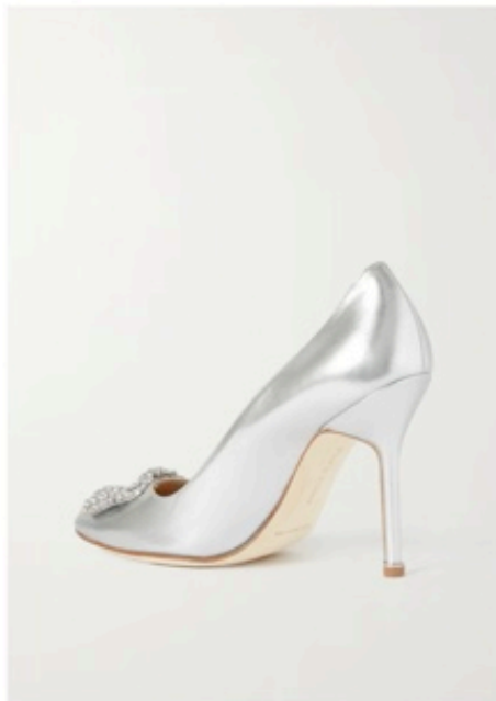
MANOLO BLAHNIK Hangisi 105 embellished metallic leather pumps SILVER