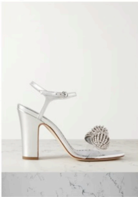
MANOLO BLAHNIK Elhob 105 crystal-embellished PVC and metallic leather sandals 49,000