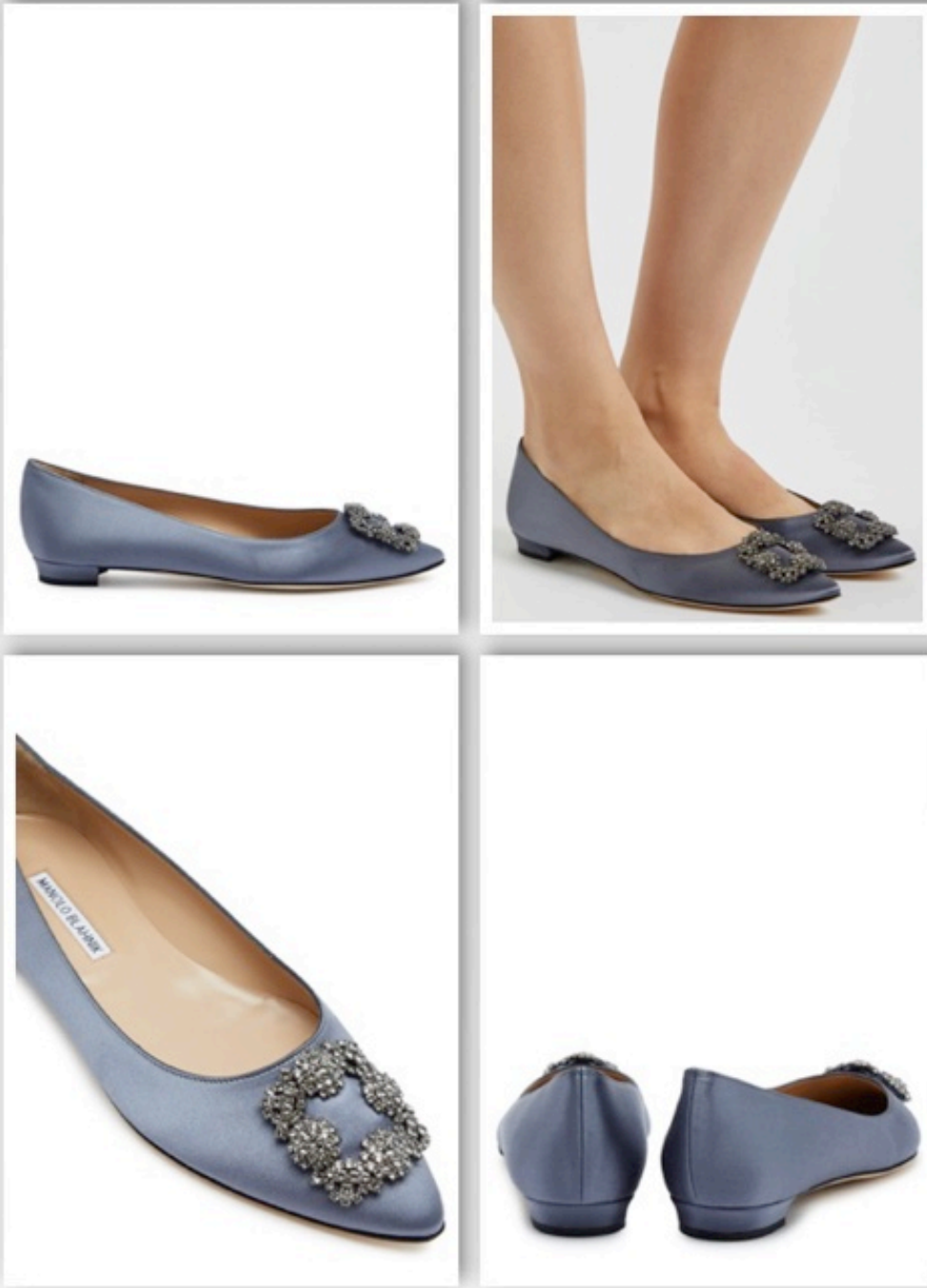
MANOLO BLAHNIK Hangisi 10 satin flats 43,000