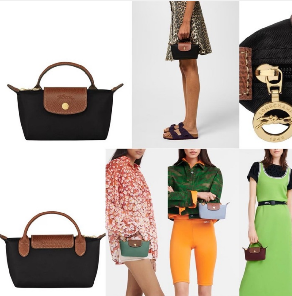
LONGCHAMP LE PLIAGE ORIGINAL POUCH BAG