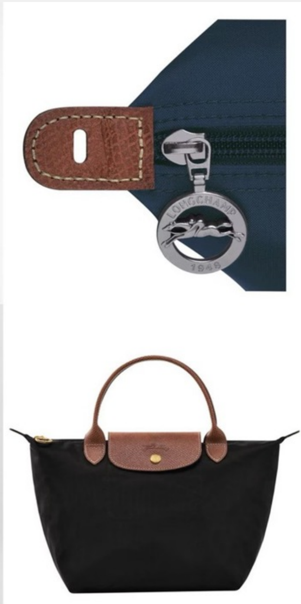
LE PLAGIAGE ORIGINAL SMALL HANDBAG