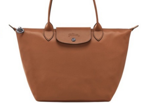
LONGCHAMP LEATHER TOTE BAG