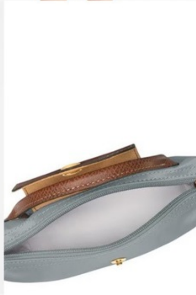
LONGCHAMP LE PLIAGE ORIGINAL POUCH BAG 6,900