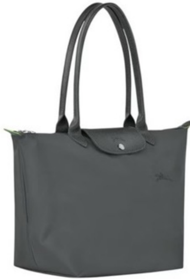
LE PLIAGE ORIGINAL L TOTE BAG - Recycled Canvas 10,900