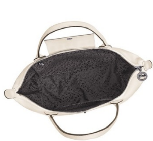
LONGCHAMP LEATHER TOTE BAG 29,000