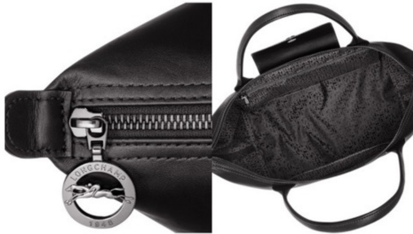
LONGCHAMP LEATHER TOTE BAG