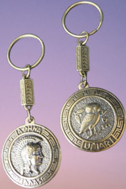
2 sided Athena keychain - Bronze