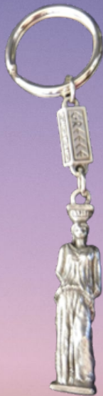
caryatid keychain - Bronze