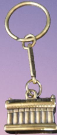
3D Parthenon Keychain - Bronze