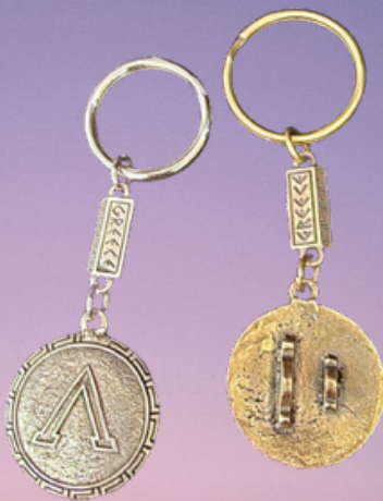
Warrior Shield Bronze Keychain